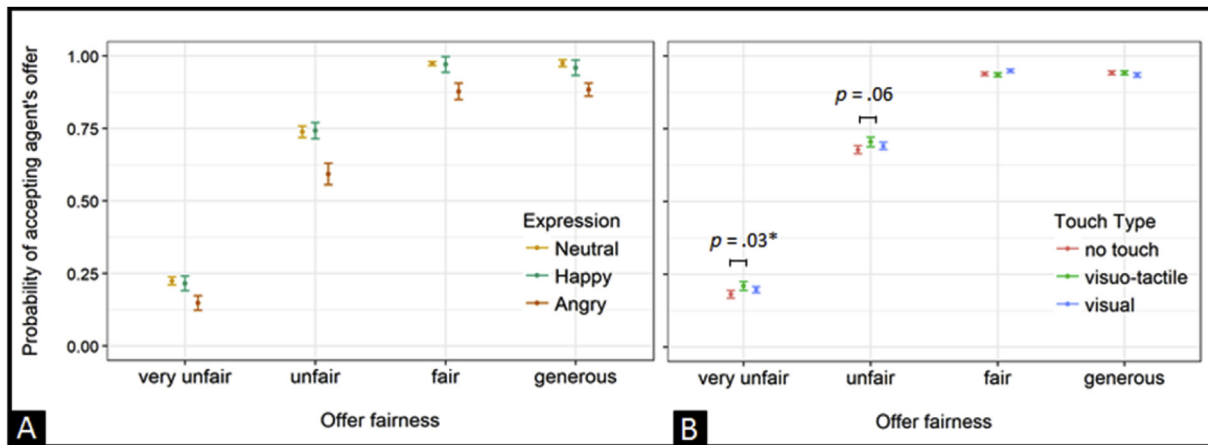
Fig. 2. Interaction effects of expression and offer (panel A) and touch and offer (panel B) on compliance. The least square means of log-odds were back-transformed to probability, and the error bars indicate the standard errors of the planned pairwise comparisons between angry vs. neutral/happy (panel A) and no touch vs. visual/visuo-tactile (panel B) at each level of offer.

SE = 0.02) compared to during the last half of the experiment ( M = 0.68 , SE = 0.02 , p = .01 , OR = 1.13 , 95% CI [1.09, 1.15]). Tukey-adjusted pairwise comparisons of ethnicity revealed that the participants were more likely to accept offers presented by African ( M = 0.70 , SE = 0.02 ) versus Caucasian models ( M = 0.68 , SE = 0.02 , p = .04 , OR = 1.10 , 95% CI [1.09, 1.11]).