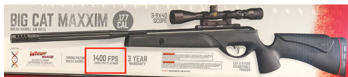
Image 1. Example of an air rifle.

Emergency medical technicians arrived to find a man lying on the sidewalk for an unknown period of time. They provided Advanced Cardiac Life Support care, intubated the man, and placed him on a cardiac monitor. The reading