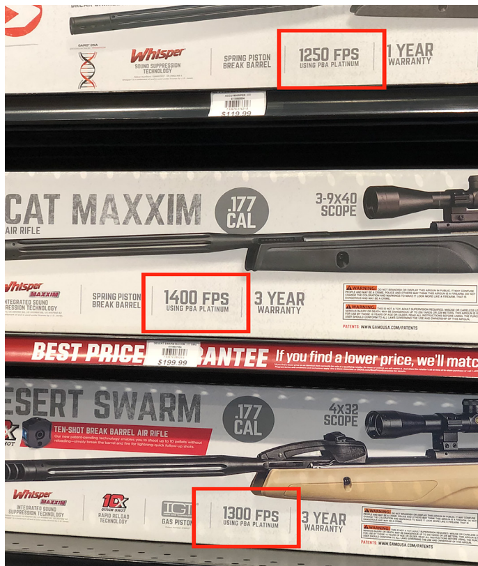
Image 3. Example of maximum velocity.

The pellet typically entered transnasally, transocularly or transtemporally, where the bone is the thinnest. 11,30,31 Several authors warn that children with these penetrating head injuries appear fine and maintain consciousness but may rapidly deteriorate. 25,32 However, injuries to the abdomen and thorax may result in fatality as well.