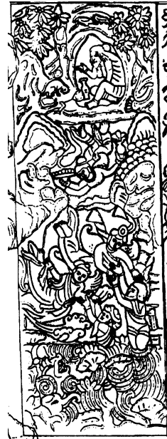
Fig. 2 Wirkak: Ascetic panel

But two other panels can also be interpreted in this way. On one of them ( Fig. 2 ) an ascetic is sitting in front of a grotto, while below winged angels rescued from a stormy sea full of monsters Wirkak and his wife, certainly an image of the Ocean of rebirth with its makara , (9) common to Buddhism and Manichaeism but totally foreign to Zoroastrianism, as is foreign to Zoroastrianism the renunciation to hunting on the first panel. Nevertheless, parts of the last panel