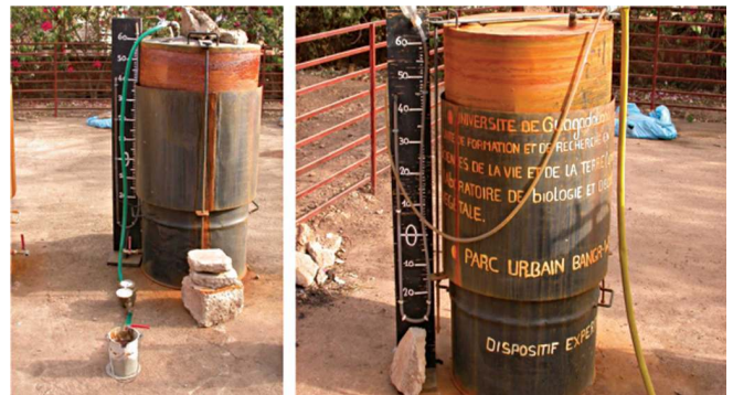
Figure 1. View of production digesters.

The installation is made up of six discontinuous-type digesters and three storage gasometers (Fig. 1). The digesters, buried