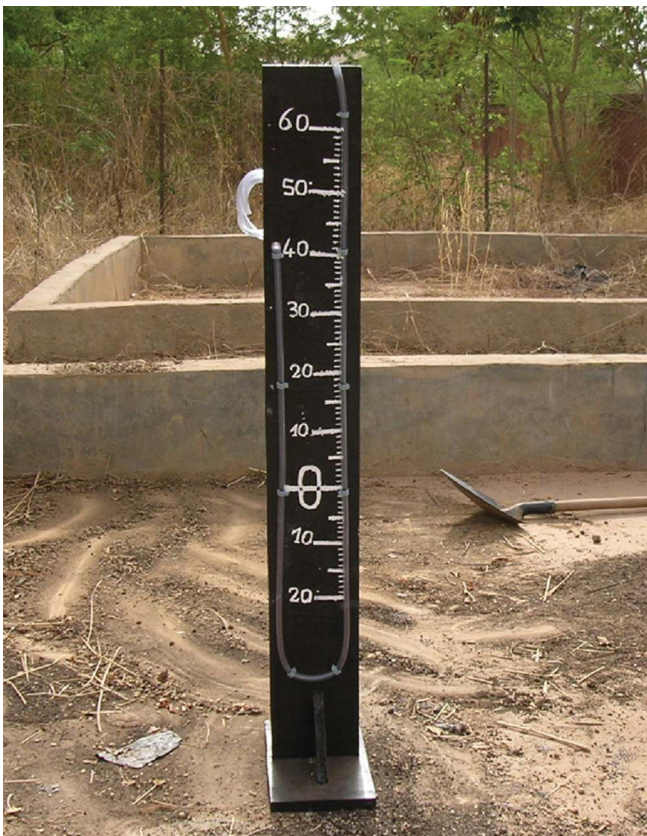
Figure 3. Hand-crafted pressure gauge.

The study's evaluation of production potential over a year revealed marked seasonal variations in biogas outflow.