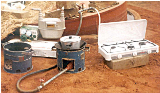
Figure 2. Biogas usage equipment.