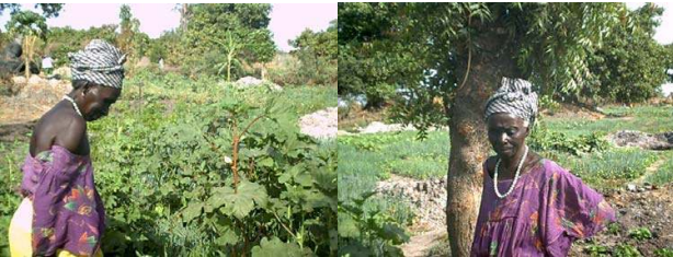
Figure 4. An elderly woman explaining the medicinal virtues of certain plant species (Source: Fall, 2007).

they are involved daily in the production of tomatoes, onions, lettuce, beets, cucumbers, green beans, mint, parsley, leek and sweet potatoes (Fig. 3). Most of the produce is sold locally and the profits are kept in a women's solidarity fund, which allows them to deal with unforeseen circumstances as necessary. With the funds obtained, they also intend to establish a micro-business to process and package tomato juice and paste, dry mint and parsley, and provide food service for the ecotourism complex.