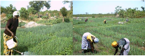
Figure 3. Women working in the market gardens (Source: Fall, 2007).