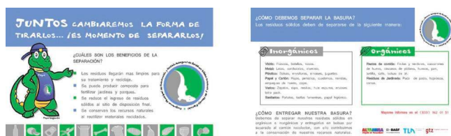
Figure 3. The project's flyer

Additionally, all 74 waste collection workers of the municipality were trained on separate waste collection and about half received new uniforms sponsored by the project.