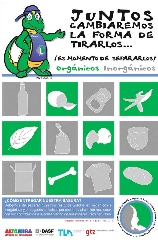
Figure 2. The project's poster