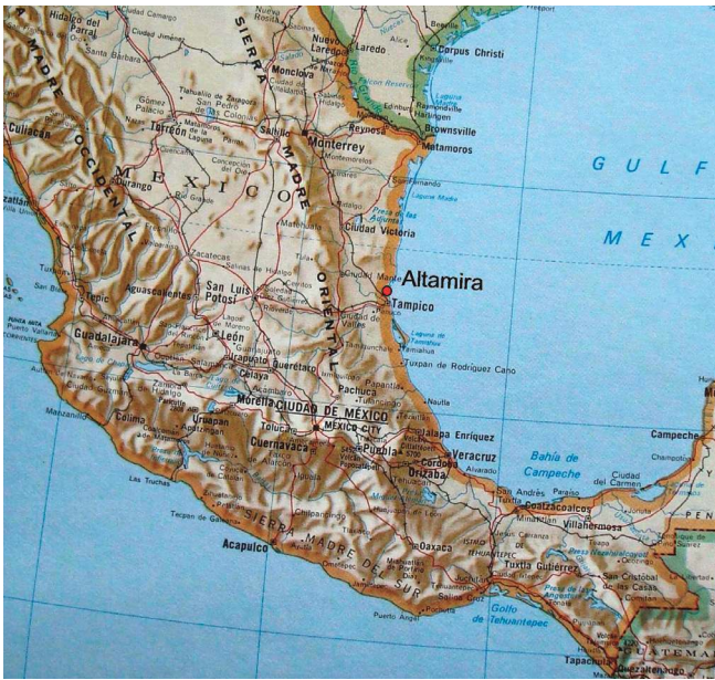
Figure 1. Geographic location of the municipality of Altamira, Tamaulipas, Mexico.

The German Technical Cooperation, the Deutsche Gesellschaft für Technische Zusammenarbeit (GTZ), commissioned by the Federal Ministry for Economic Cooperation and Development (BMZ) of the German Government, promotes PPPs on a global basis as a part of its instruments to foster sustainable development. In Mexico, the GTZ office has been involved in an alliance with BASF Mexicana, Terminal of Liquefied Natural Gas of Altamira (TLA) – a joint venture of enterprises Shell, Total and Mitsui – and the municipality of Altamira, Tamaulipas, for the design and implementation of the municipality’s ISWM program. Both private enterprises have operational presence in Altamira and are thus, interested in investing in the local community.