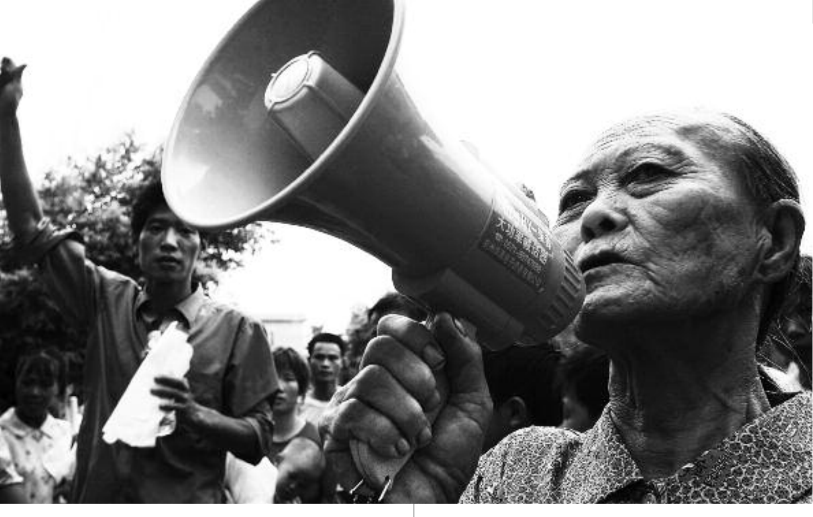
Demonstration in Taishi, July 2005.

formance is negligible. Even for officials and cadres who lack driving professional ambition, measures that promote economic development can bring tremendous personal benefit in the form of salaries and incomes that increase in line with the improved economic performance of their localities. They enjoy better benefits, they build majestic homes with taxpayer funds and then legally assign the houses to themselves and their families, they upgrade their automobiles through the government budget, and they enjoy frequent opportunities to travel abroad, attend banquets, and participate in other forms of entertainment, all at the public expense. (11) Moreover, the potential for illicit profit expands when the local economy prospers. Construction projects enable local cadres to shave a significant share of the budget, public or private, into their own pockets. Creating local investment also provides opportunities to take bribes - for example, cadres' children are more likely to become the chairmen or CEOs of companies jointly sponsored by overseas investors and local governments. Economic prosperity is, therefore, not only a major source of political legitimacy for China's Communist regime, as many have noted; it is also the main ore deposit that individual officials and cadres can mine, legally or illegally, for their personal enrichment. The entrepreneurial nature of the Chinese state (12) pertains