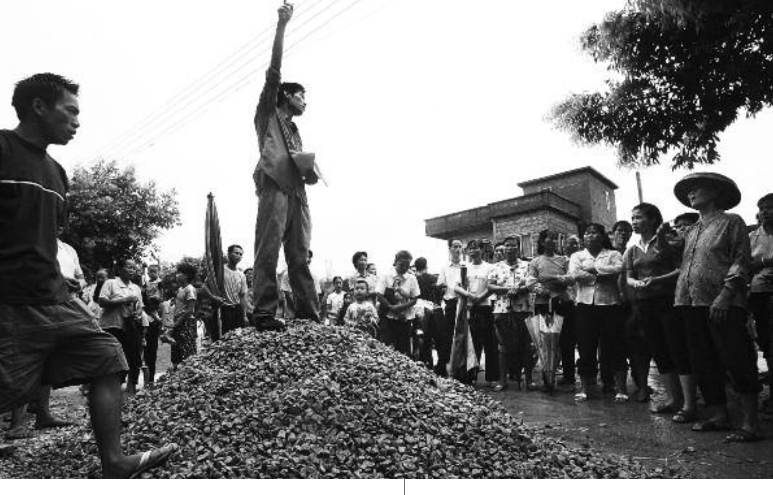
Taishi, July 31, 2005. Villagers protest against corruption of local officials.

Dongzhou, local government is more often the major obstacle to citizen engagement in public affairs. One has to comprehend this in order to understand the politics of governance in today's China.