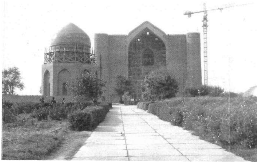
Turkestan/Yasi, mausoleum of Khwaje Ahmad Yasavi (1394-99), to the left the reconstructed mausoleum of Rabi'a Soltan, ca. 1485