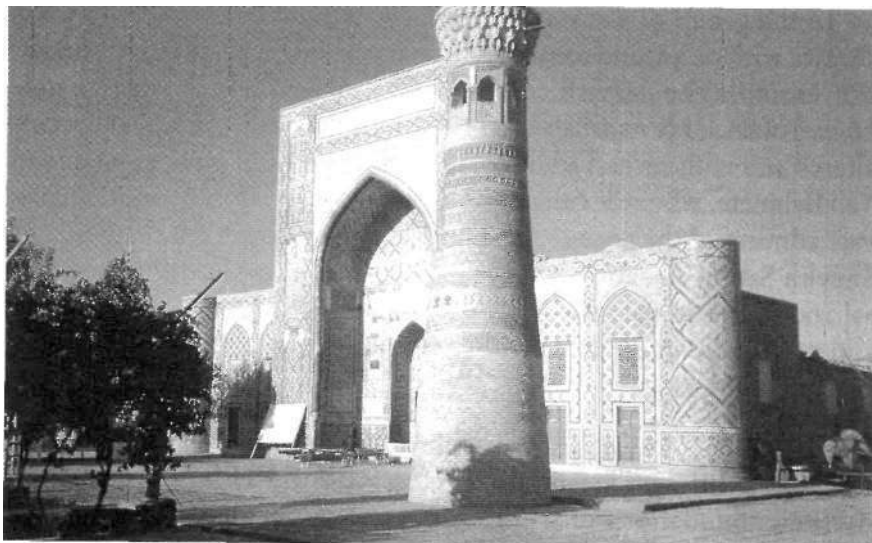
Ghojdovan, mausoleum complex of 'Abdalkhaliq Ghojdovani (mid. 15th century and later)