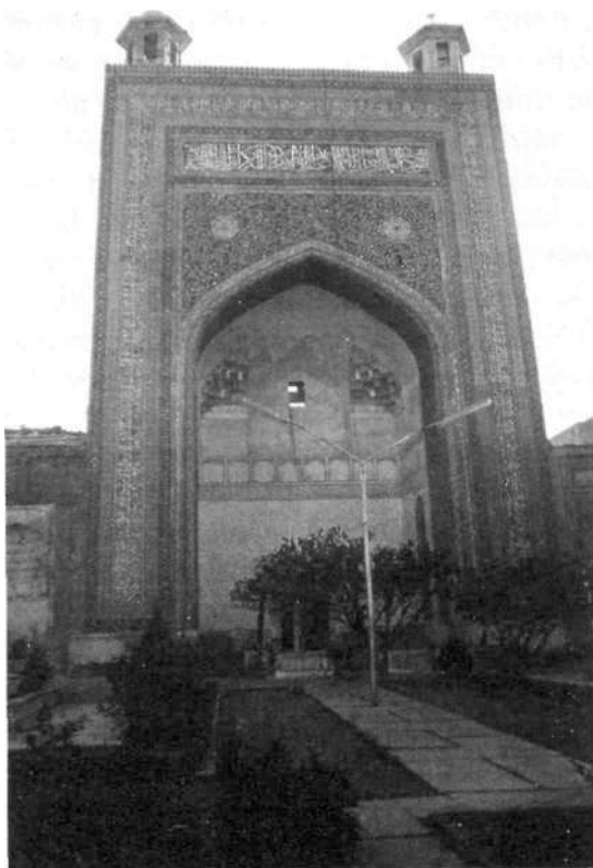
Torbat-e Jam, tomb and ensemble of Sheikh Ahmad-e Jami, façade, ca. 1440