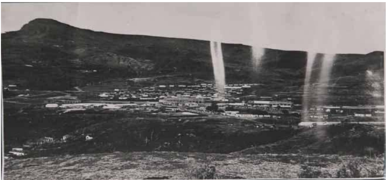
Figure 4. Old photograph of the Pico do Cauê in 1932, before mineral extraction.

place an emphasis on the practical and statistical gains that the task contributes to the research.