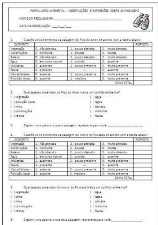
Figure 1. Example of the “Environmental Form”.

as a result, reflects the expectations, the demands and the ecological problems of the situation in Itabira 3 . This phase also included investigation work on the matter, distributed among the students. The fieldwork organisation team also worked on obtaining the equipment necessary to make observations of the landscape and to record the activity, such as compasses, binoculars, digital cameras, etc.