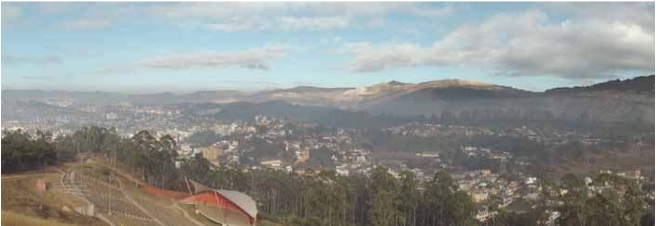
Figure 2. Photograph of the Pico do Amor landscape. Note the urban constructions, the reforestation with eucalyptus trees of part of the Pico and the iron ore extraction in the background.