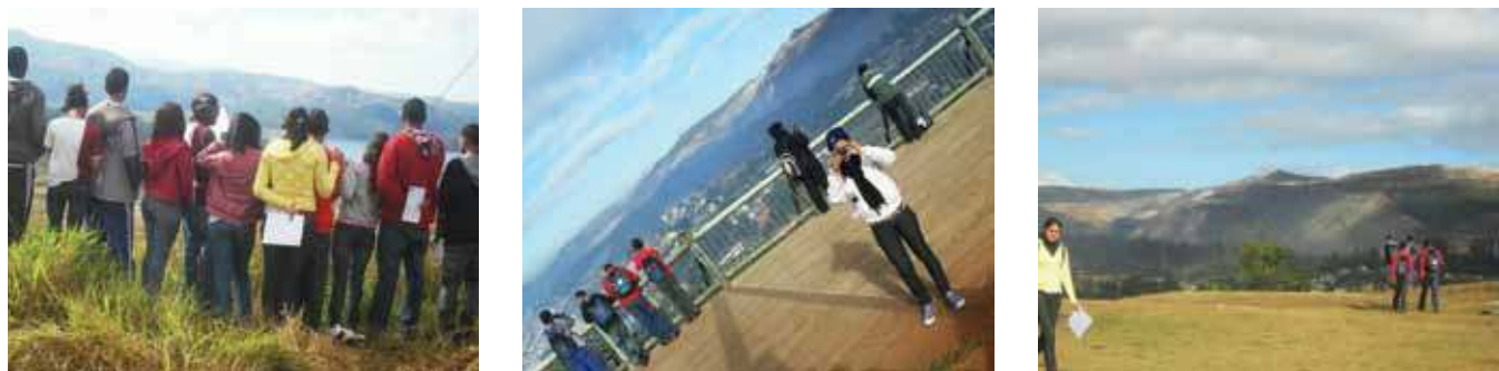
Figure 5. Site photographs.

this, it can be seen that the scale is very useful for quantitatively highlighting subjective and qualitative observations. The name of the scale is a homage by one of the participants in the project to the poet Carlos Drummond de Andrade, who lived through and suffered alterations to the landscape of a city that experienced the devastating power of mining companies 5 . It is worth highlighting that the largest scale landscape alteration perceived by the illustrious poet and by the oldest inhabitant was the complete destruction of the Pico do Cauê, nowadays called the Cauê mine—which is a large opening in the ground with a width and depth of several metres, and which can be easily seen from the “Morro da Pousada” viewpoint that was visited.