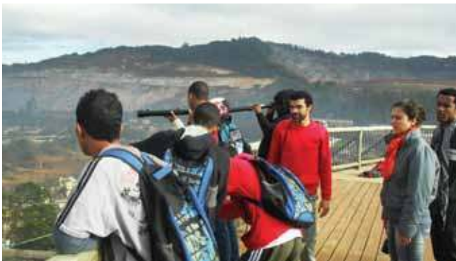
Figure 8. Site photographs—The History, Science and Geography teachers and students.

guidelines referring to environmental degradation and changes to the city's ecology and landscapes. Based on the landscape aspects available on the form, students were given the task of noting which aspects had suffered alterations and to what level.