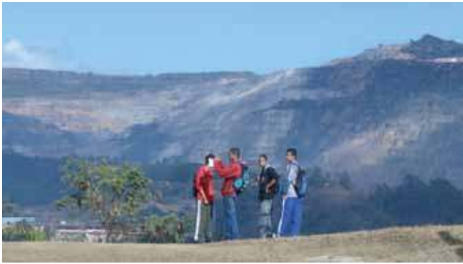
Figure 6. Site photographs.