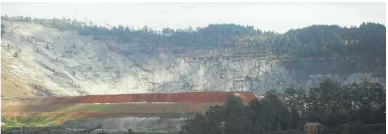
Figure 3. Photograph of the Morro da Pousada landscape. Note the old Pico do Cauê excavation and the ore industry in operation.

word to describe the landscape observed at each viewpoint. The words were: