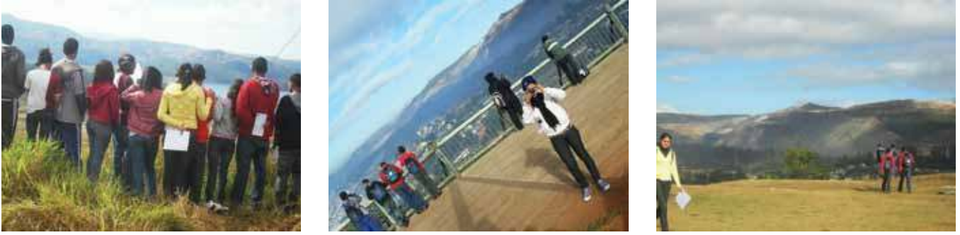
Figure 5. Site photographs.

this, it can be seen that the scale is very useful for quantitatively highlighting subjective and qualitative observations. The name of the scale is a homage by one of the participants in the project to the poet Carlos Drummond de Andrade, who lived through and suffered alterations to the landscape of a city that experienced the devastating power of mining companies 5 . It is worth highlighting that the largest scale landscape alteration perceived by the illustrious poet and by the oldest inhabitant was the complete destruction of the Pico do Cauê, nowadays called the Cauê mine—which is a large opening in the ground with a width and depth of several metres, and which can be easily seen from the “Morro da Pousada” viewpoint that was visited.