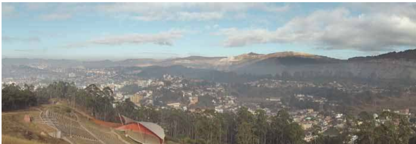
Figure 2. Photograph of the Pico do Amor landscape. Note the urban constructions, the reforestation with eucalyptus trees of part of the Pico and the iron ore extraction in the background.