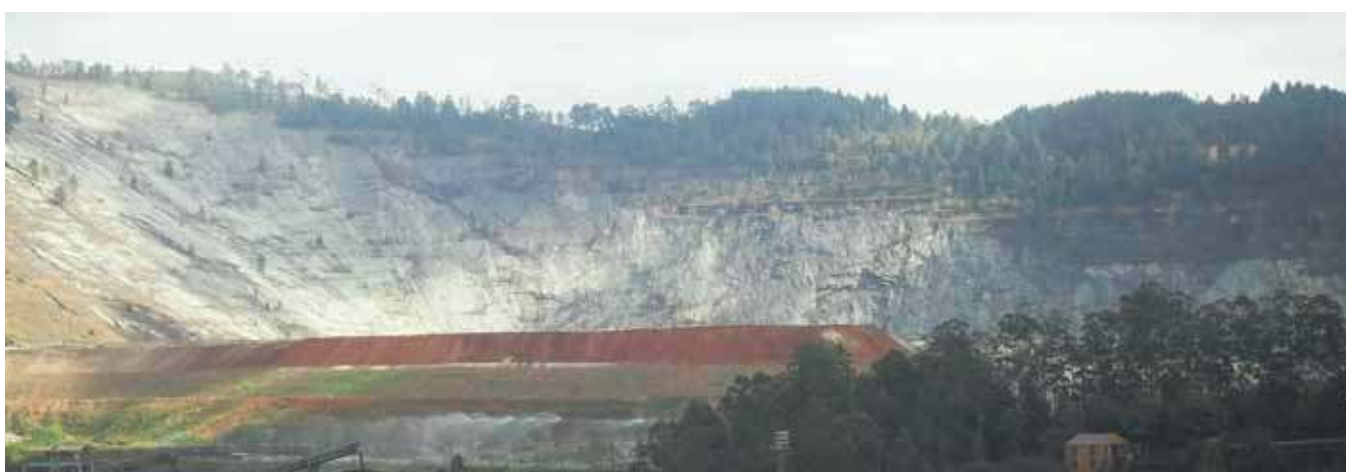
Figure 3. Photograph of the Morro da Pousada landscape. Note the old Pico do Cauê excavation and the ore industry in operation.

word to describe the landscape observed at each viewpoint. The words were: