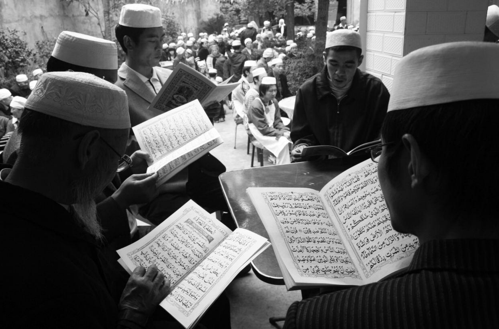
Moslem Hui Community in the Pi county (vicinity of Chengdu). The number of believers is strictly correlated with that of the members of ethnic communities.