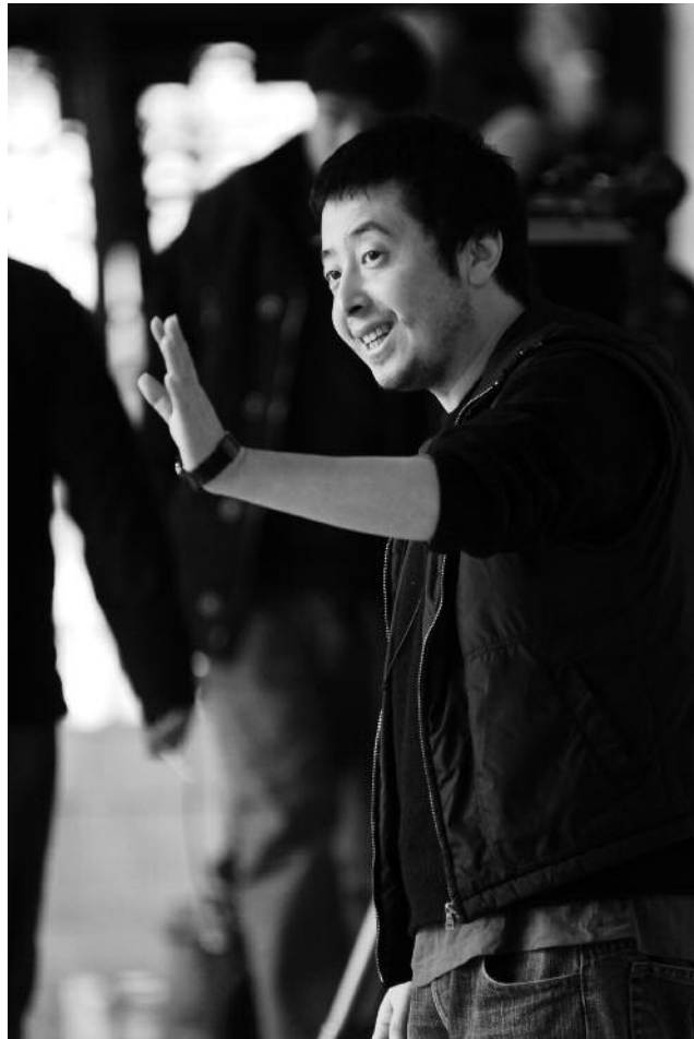
Jia Zhangke during the shot of 24 City .

When we began making films, we had almost forgotten that film could actually transmit our own individual feelings. The best example of this is scar literature and film. After the catastrophe ended, the people who had experienced such a period of tremendous turmoil wrote a type of literature that took a completely mainstream position, reflecting the Party's own change in attitude. This was a great pity. A lot of things had been obscured in the revolutionary narratives: private space, daily space. The only thing that was preserved was memories of the collective. The only slightly less ideological activities were things like playing basketball,