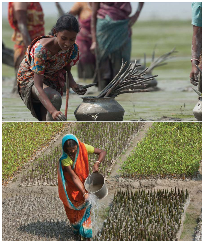
Figure 3a. Replanting ©hellio-vaningen 3b. Watering plantations ©hellio-vaningen

The sites were on ‘charlands’ i.e. islands that emerged in the siltation process and also narrow but continuous patches along the mudflats that acted as ‘bio-shield stretches’.