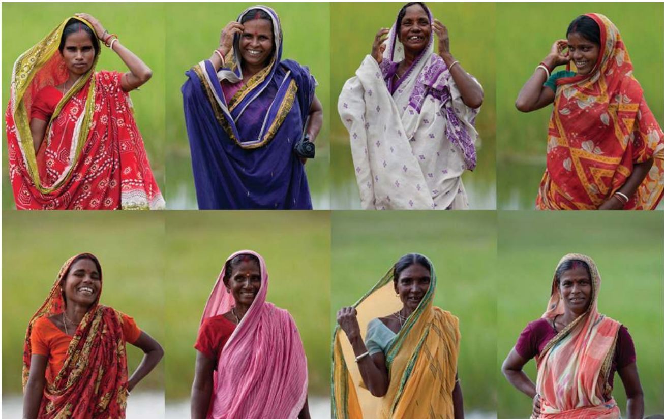
Figure 4. Women portraits

To extend this business model further into forest and wetland conservation projects, the REDD+ is a good mechanism that gives enough scope not only to restore degraded lands but also prevent further degradation of forested lands. However