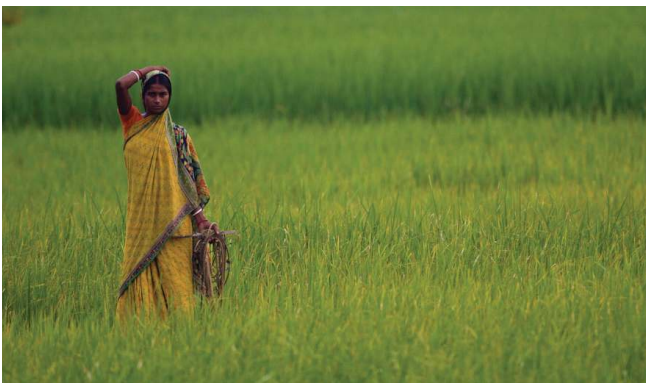
Figure 2a. Fisherman ©hellio-vaningen 2b. Woman in a rice field ©hellio-vaningen

The Government has taken intense programme on generation of income through self-help groups and it appears from researches in post-aila period that the dependence on unsustainable use of ecosystems resources has increased. The general condition of life has not improved rather it appears to be more critical with shrinking agricultural options esp post-aila period when the soil was under saline cover and the regular paddy yields decreased, scarcity of freshwater resources adding on to the woes of people. The fish catch has also remarkably reduced and changed with commercial catch decreasing (Mitra et al, 2009). Post-Aila period man-animal conflict