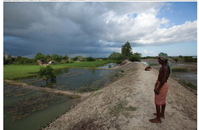
Figure 1a. Embankment ©hellio-vaningen 1b. Construction of embankment ©hellio-vaningen

Thus in present situation identification of stable, accreting lands for afforestation is a key task.