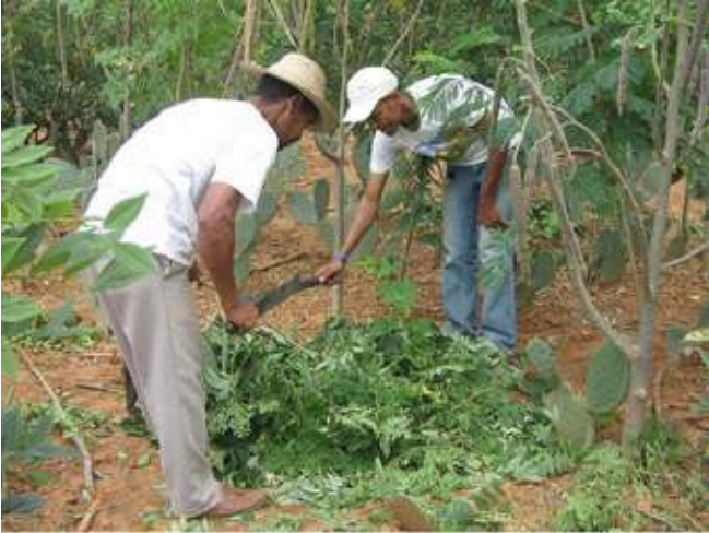
Figure 6. Farmers covering soil

Another important feature that was observed is that by cultivating different species in the same area, the area itself becomes more resistant to pests, dispensing with the need for chemical pesticides.