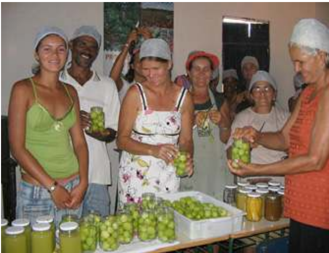
Figure 3. Storage and use of surplus fruit

Along with increased production of fruit, vegetables and legumes, farmers now have the incentive and will to speak up in associations to promote the sale of surplus produce. With IPB support in project preparation, the new associations have managed to buy sheds for shared use and pulpers to enable them to sell some of their produce in already industrialised form as juice pulp and jellies, thus seeking to increase family income and prevent waste (see figure 3).