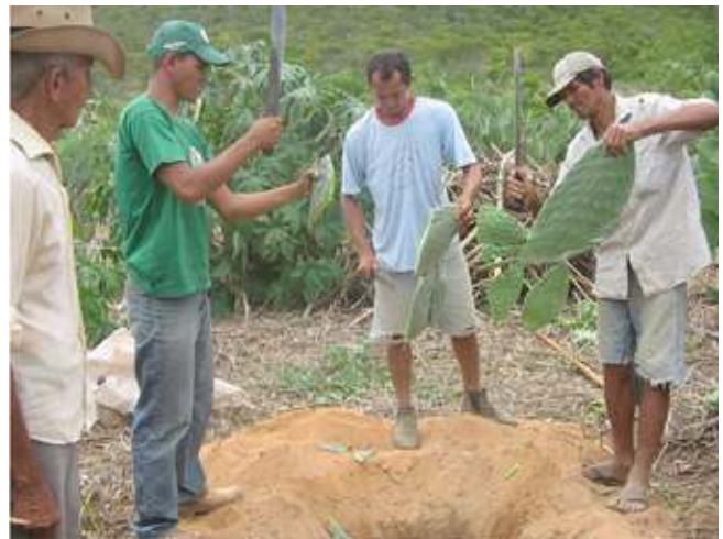
Figure 5. Farmers chopping palms, plants native to Caatinga, that are about 90% water, to prepare the soil

One of the techniques applied was the use of palm and mandacaru, plants native to Caatinga, chopped into small pieces and then placed in holes around other crops (see figure 5). Since palm and mandacaru naturally store a lot of water, they therefore release some of this for use by other plants.