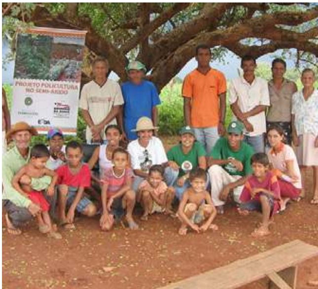
Figure 4. Farmers and their families in the project

Social capital (trust among stakeholders) was improved to the extent that in most cases, polyculture fields have been planted and managed jointly. The sale of surplus produce has also been organised on a collective basis through one of the associations created as a result of the project.