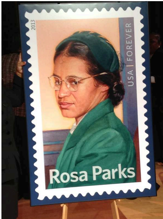
Fig # 2 : Rosa Parks Stamp, released on February 4 th , 2013

GC & AC : What do you think of the "forever" stamp series ?