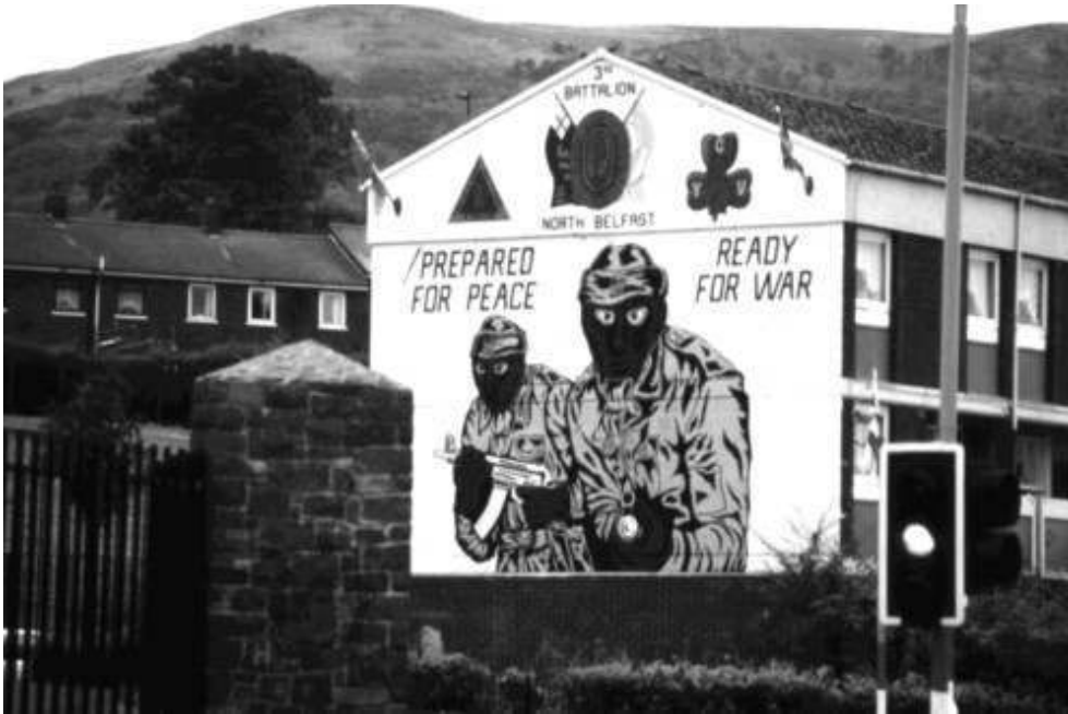
COMMUNITIES IN CONFLICT : PROCLAIMING THE MESSAGE IN A BELFAST STREET