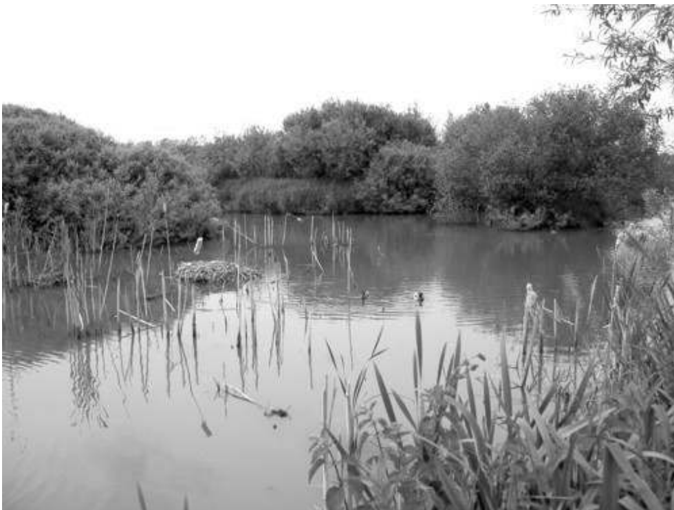
URBAN SUSTAINABILITY ? BOG MEADOWS CONSERVATION AREA, BELFAST

For thirty five years The National Commission for the Teaching of Geography, a subgroup of the National Committee, has promoted and enhanced geographical education through influencing decision-making on new initiatives, both north and south of the border, especially on curriculum matters. The Commission, which maintains strong links with the IGU, has also provided contemporary insights over the years to geography educators from all parts of Ireland ; recent conferences and workshops have highlighted learning outside the classroom, the European dimension and intercultural education. At a time when crossing borders and reaching out into a wider world is so important for geographers and geography educators, it is a great regret that a decision has been taken to disband the National Commission after June 2004.