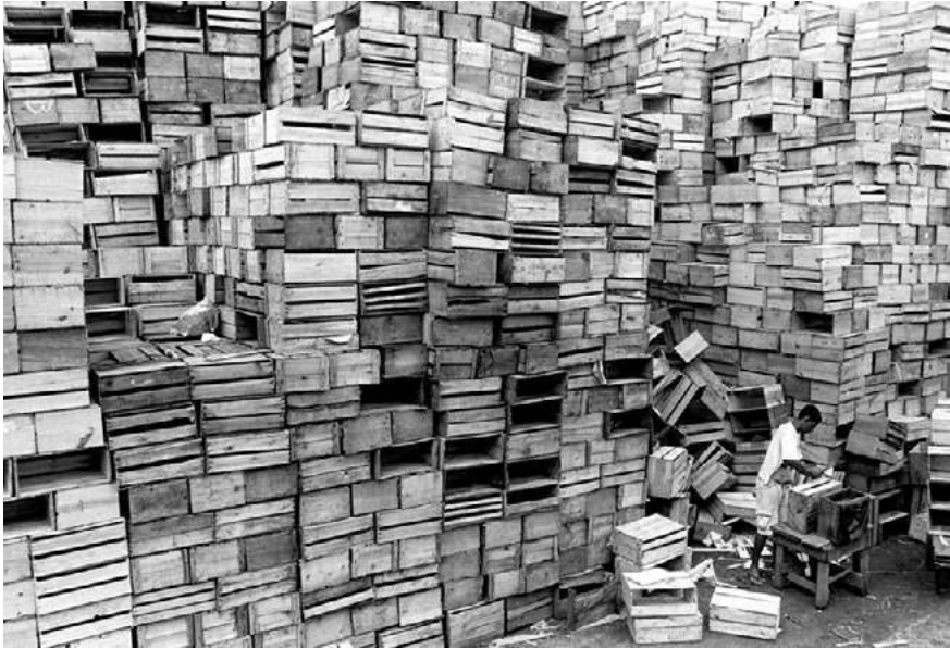
Figure 2. Boxes used for the transportation of horticultural products in the São Paulo General Warehousing and Centres Company (CEAGESP).