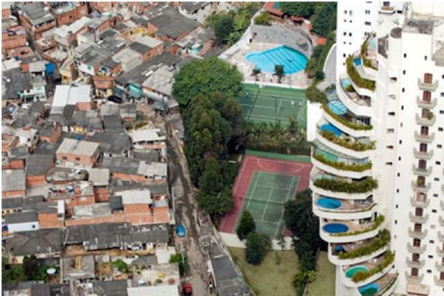
Figure 1. Social and environmental diversity: a slum lives cheek by jowl with a high standard building at Morumbi quarter, in São Paulo.

Today, city growth averages one million people every week. In 1950 there were 86 cities with more than one million inhabitants, today they are some 400 across the world. However the most significant effect of the urban process is, without doubt, the explosion of megacities. It took one century for the urban population – around 3.4 billion – to surpass the world’s rural population, but United Nations projections indicate that by 2025 the urban population will reach 61 per cent of the total.