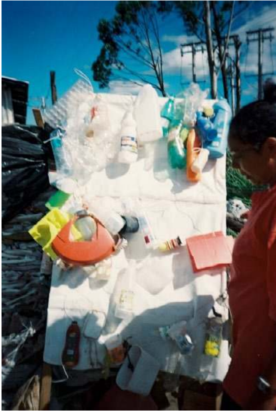
Figure 4. COOPERCOSE (Recycling and Selective Collection Cooperative) classification table.

expectations? If traditional museums had the power to revere and nominate what should not be forgotten, why can't we consider that the city museum has the power of reflecting, of modifying, of restating, of heightening the present, and thus redesign, in real time, our own future? Would there be time to wait for the natural aging of objects? Wouldn't that process be much more contaminated today than it was in the past?