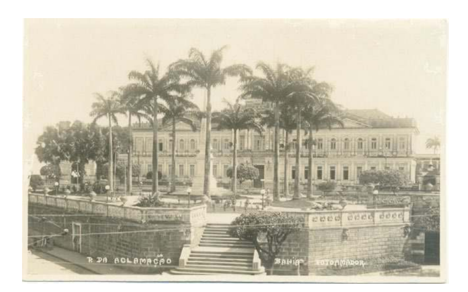
Figure 11 1930 - Aclamação Square