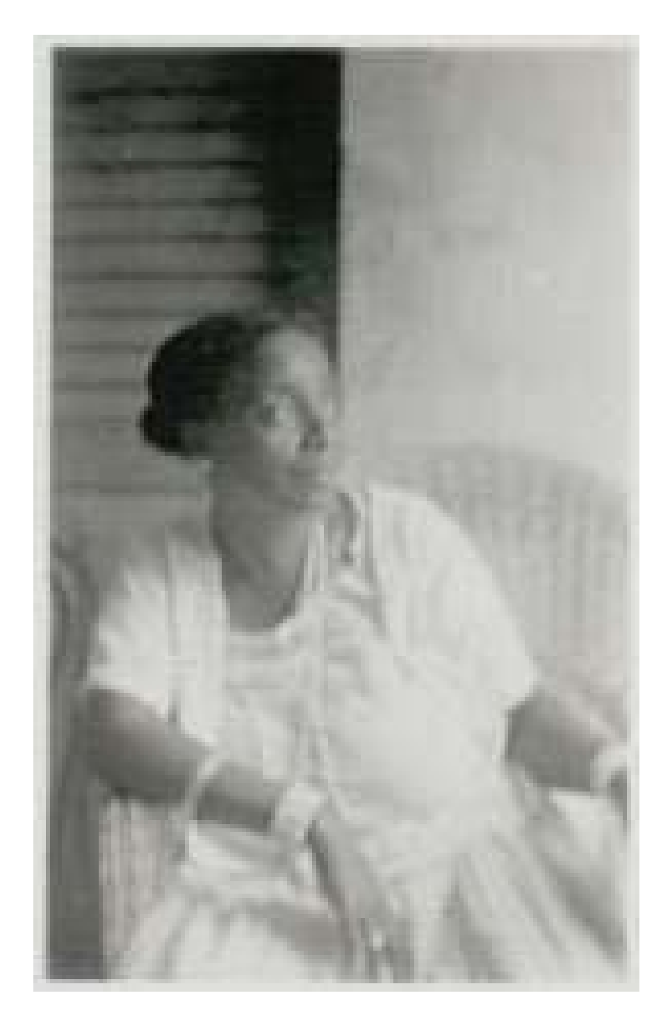
Figure 19 Osidagan, oxalá robe, Aché", October 1938