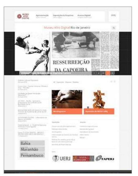
Rio de Janeiro www.museuafrodigitalrio.org