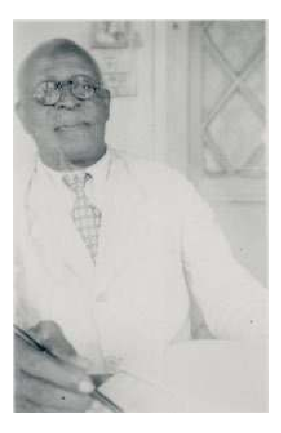
Figure 21 "Martiniano do Bonfim, Bahia", August 1938

CollectionRuth Landes in BrazilSourceNational Anthropological Archives, Smithsonian Institute, Suitland, Virginia