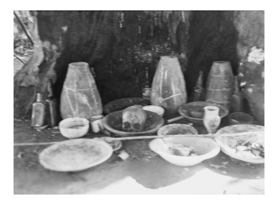
Figure 8 Offer to the orixas, 1941

CollectionMelville Herskovits in BrazilSourceSchomburg Center, New York Public Library System