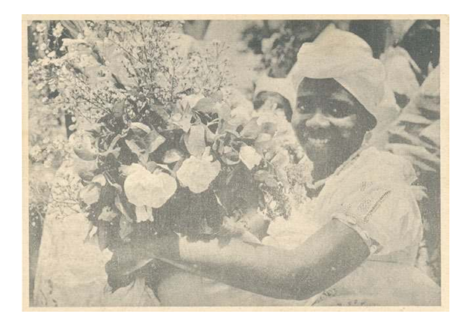
Figure 15 Offer to the Orixas about 1950