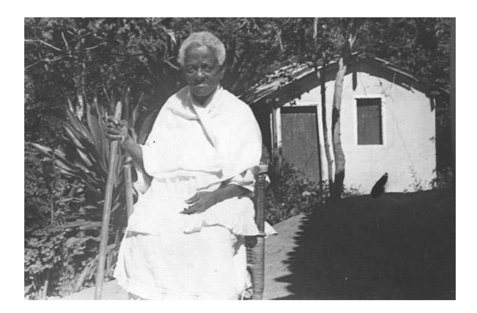
Figure 7 Woman in yard of the Gantois candomble house, Salvador, Bahia 1940.