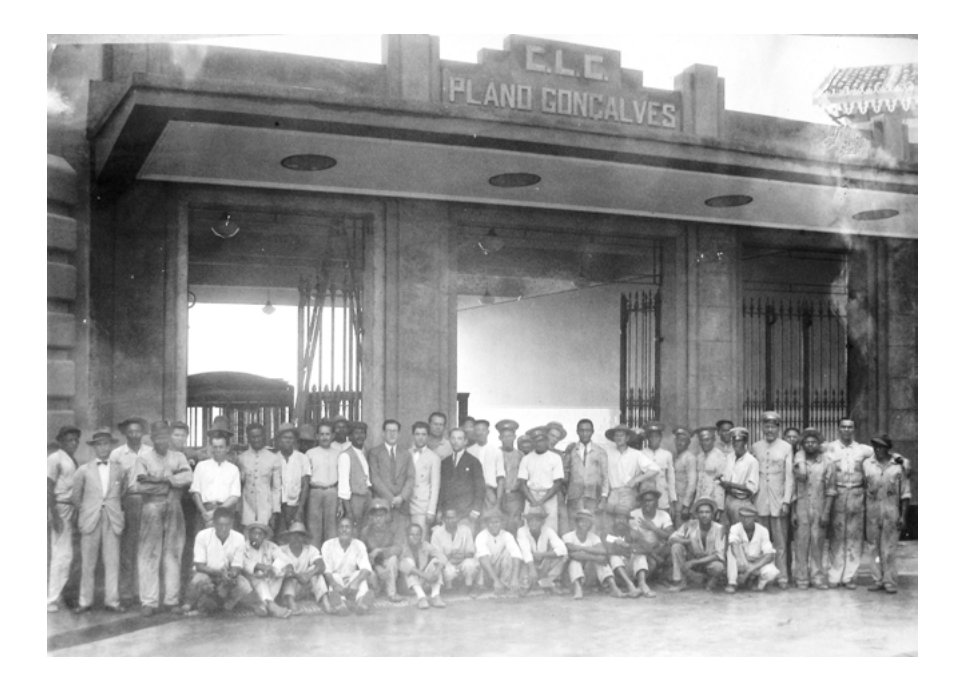
Figure 16 Cable-car worker about 1920

Collection Black Workers in Bahia Source Cristiane Vasconcelos' Private Collection