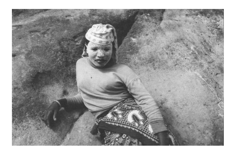
Figure 1 Woman with chalk paste on her face – about 1990

Collection African bodies