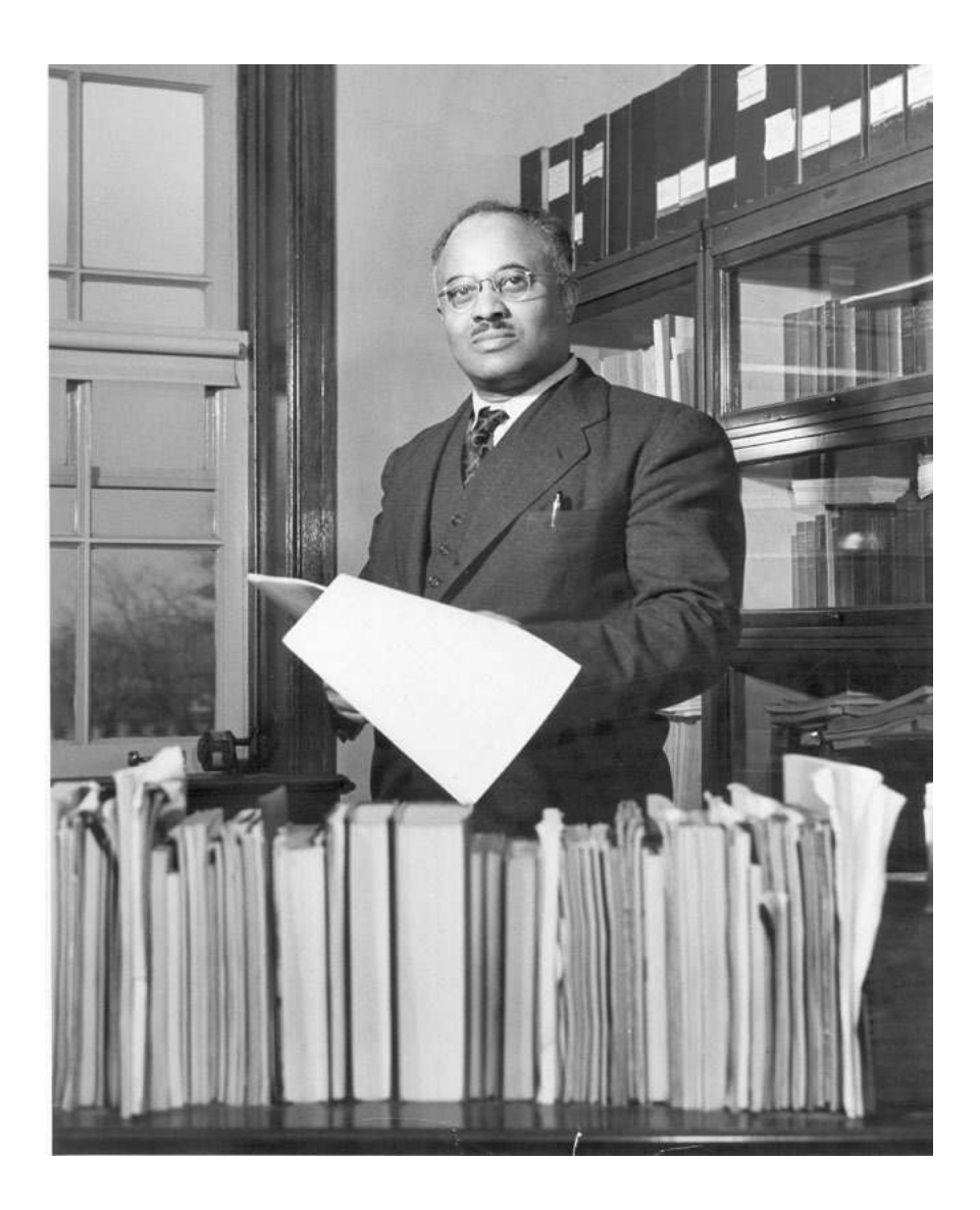
Figure 4 Portrait of E. F. Frazier

CollectionE. Franklin Frazier in BrazilSourceMoorland-Spingarn Archive,<br/>Howard University, Washington DC.