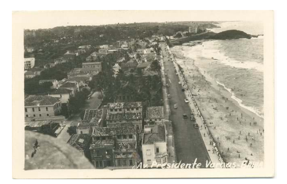
Figure 13 1935 – Barra lighthouse