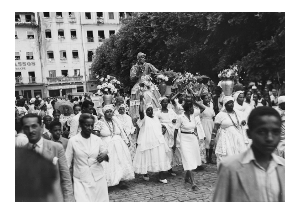
Figure 9 The Bomfim Pageant, 1941