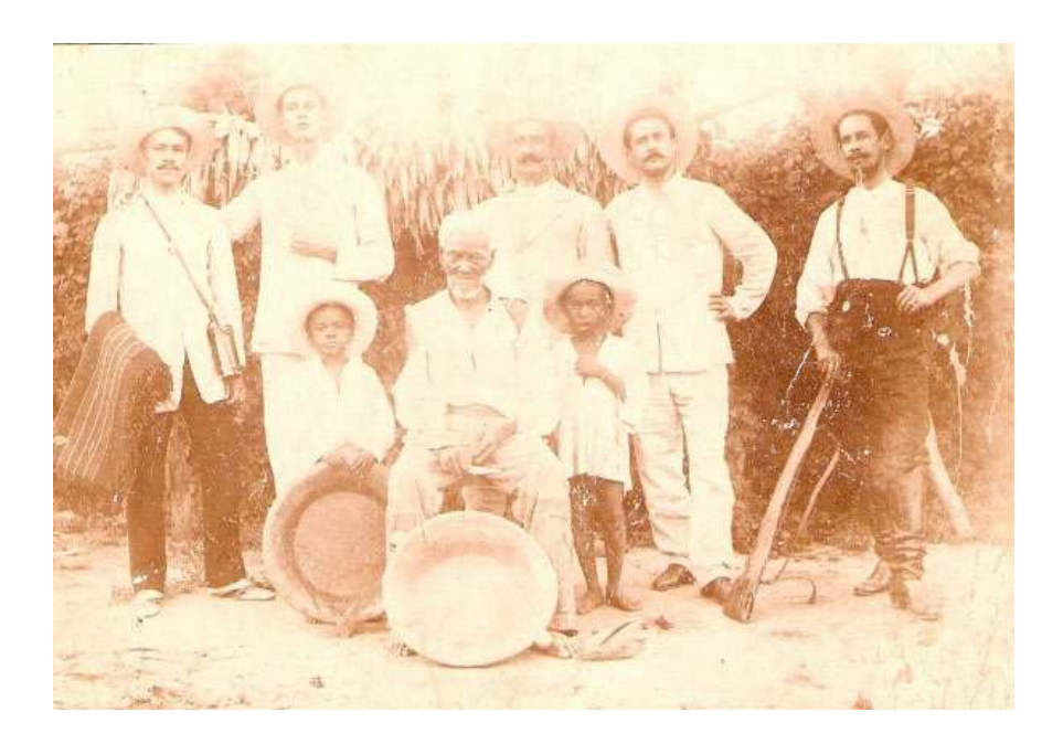
Figure 3 Slaves in the Bahian hinterland about 1880

Collection Digitalization Project of the State University of Feira de Santana (UEFS)