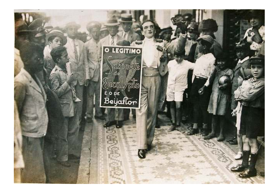
Figure 14 Comercio propagandista de rua 1 - Street advertising about 1930