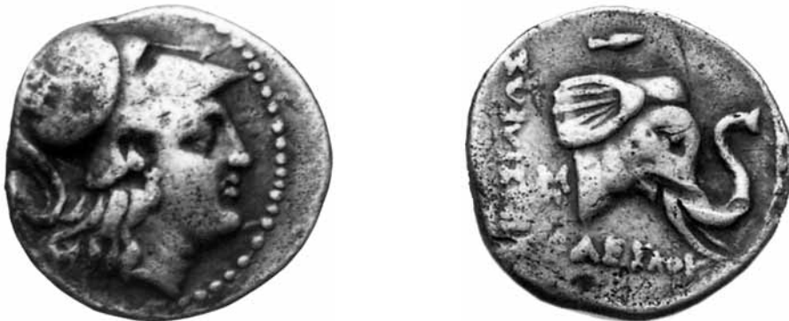
Figure 6. Head of Athena wearing crested Corinthian helmet/Elephant head (Drachm, Seleukeia on the Eulaios [Susa]), SC 181.