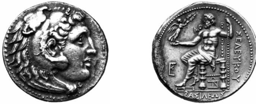
Figure 13. Head of young Heracles wearing lion skin/Zeus Nicephoros (Tetradrachm, Sardeis), SC 3.3b.

in the pose seen on the elephantarches bronze. But Heracles is depicted in Greek art either clean shaven, or with a short, thick, curly beard, whereas the figure on our coin has a long, straight, slightly wispy beard. Dionysos, too, is portrayed either beardless or bearded. In the latter cases his beard is usually long and relatively straight, as on our coin type. Dionysos is one of very few Greek gods to wear a beard of this sort. He is also strongly associated with the pose seen on the elephantarches bronze, so much so that even the headless statue from Olympia is identified as Dionysos (fig. 14) 22 . The pose of this statue closely resembles that of the coin: in both cases the figure sits on a rock partially covered by his himation , his left hand posed in the same way on the rock. In many of his depictions, Dionysos is seated on a rock, as here. The examples of Dionysos in repose are numerous, especially on coins and in sculpture 23 . Finally, there was a direct link between Dionysos and the turban: according to Megasthenes, Seleucos' ambassador to India, it was Dionysos who taught the Indians to wear turbans 24 .