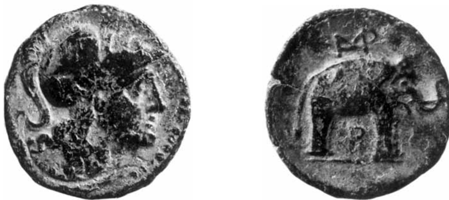
Figure 2. Head of Athena wearing crested Corinthian helmet/Elephant (AE, Seleukeia on the Tigris, workshop I), SC 128a.