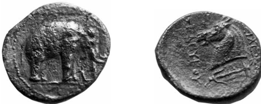
Figure 9. Elephant/Horned horse head (AE, Apameia), SC 35.