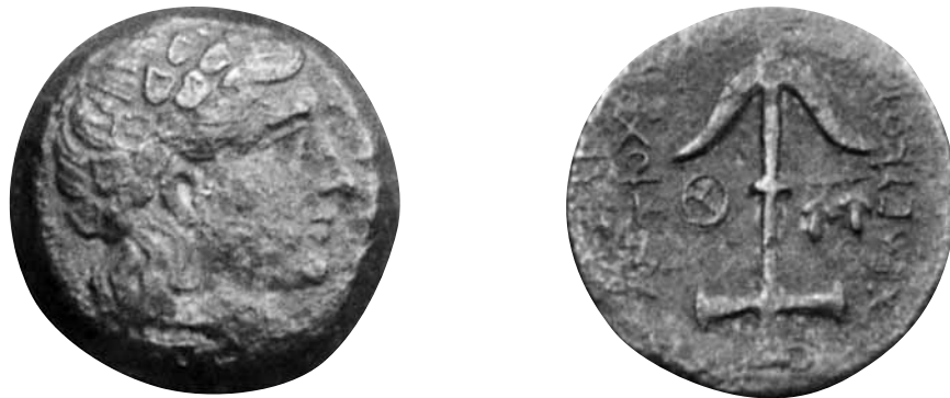
Figure 19. Head of Dionysos wearing ivy crown/Anchor (AE, Baktrian mint), SC 289.