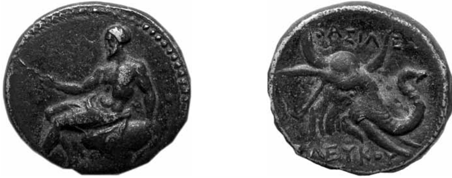
Figure 10. Male figure seated on rock/Horned elephant head (AE), SC 25. From Petr Veselý collection, Czech Republic.