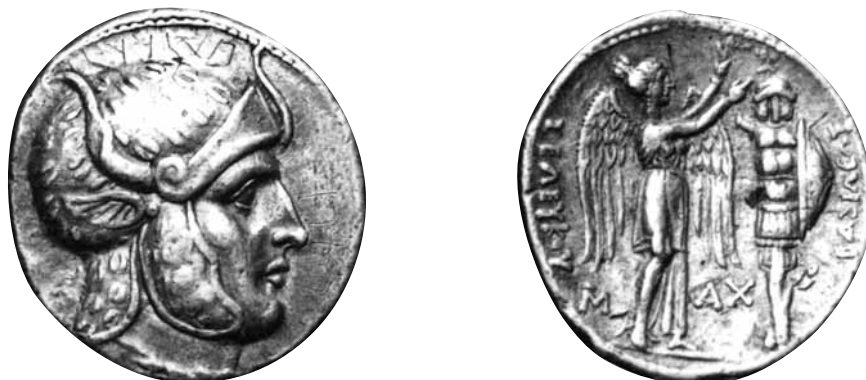
Figure 15. Seleucus wearing helmet with Dionysiac attributes/Nike crowing trophy (“Trophy tetradrachm” Seleukeia on the Eulaios [Susa]), SC 173.14.