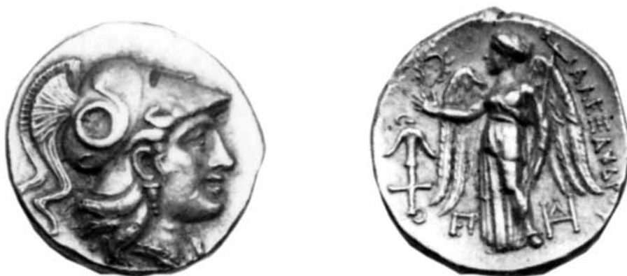
Figure 20. Head of Athena wearing crested Corinthian helmet/Nike standing holding wreath and stylis (AV stater, Babylonian mint 6A), SC 66.