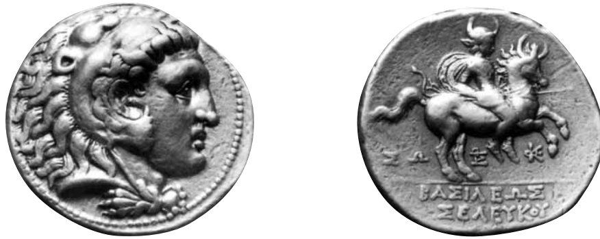
Figure 21. Head of young Herakles/Horseman wearing helmet with Dionysiac attributes (Tetradrachm, Ekbatana), SC 203.