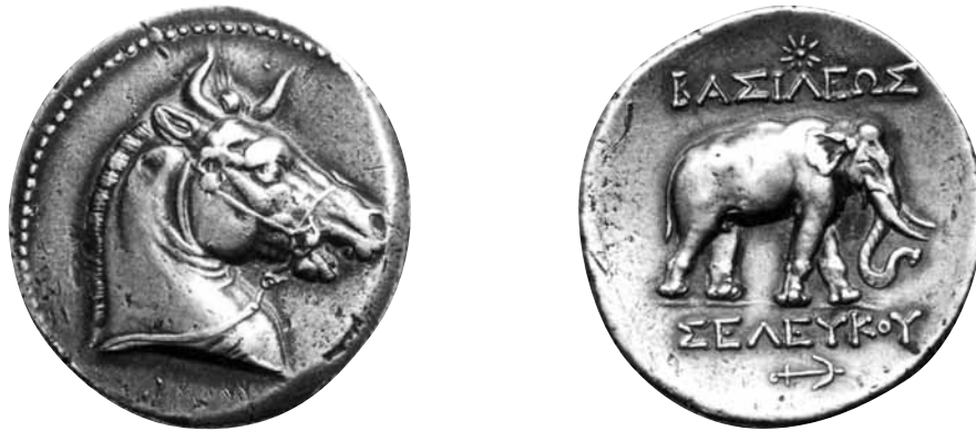
Figure 7. Horse head/Elephant (Tetradrachm, Pergamon), SC 1.2.