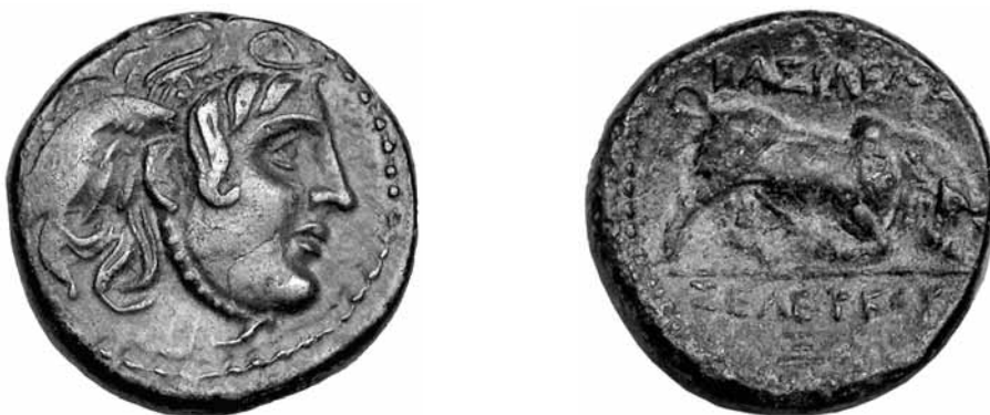
Figure 16. Winged head of Medusa/Bull butting (AE, Antioch), SC 21.2b.