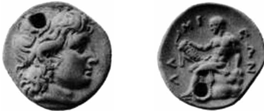
Figure 11. Female head (Lamia?) wearing tainia and earring/Heracles seated on rock presenting his quiver, BMC Thessaly , p. 22, no. 8, pl. 4, 1.