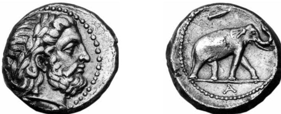
Figure 3. Laureate head of Zeus/Elephant (Silver stater, Seleukeia on the Eulaios [Susa]), SC 187.1a.