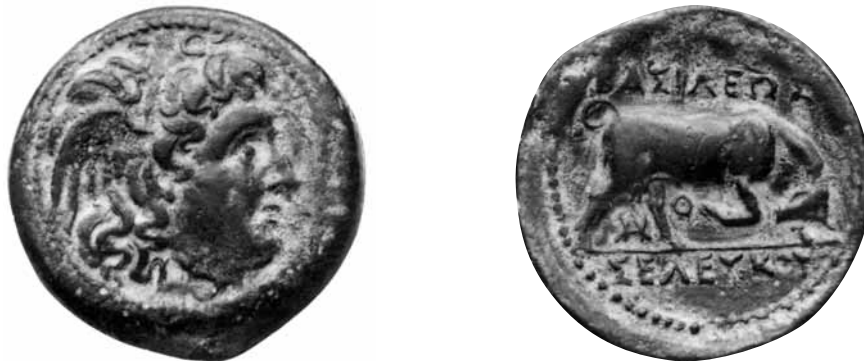
Figure 12. Medusa/Bull (AE, Seleukeia on the Tigris, workshop II), SC 151.2.