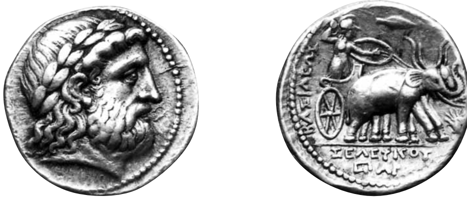
Figure 1. Head of Zeus/Elephant biga (Tetradrachm, Seleukeia on the Eulaios [Susa]), SC 177.1a.