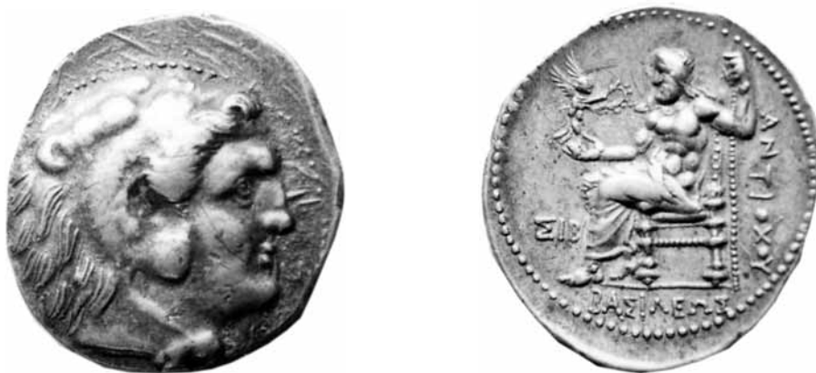
Figure 23. Head of young Herakles/Zeus Nicephoros (Tetradrachm, Seleukeia on the Tigris, workshop I), SC 120.1a.