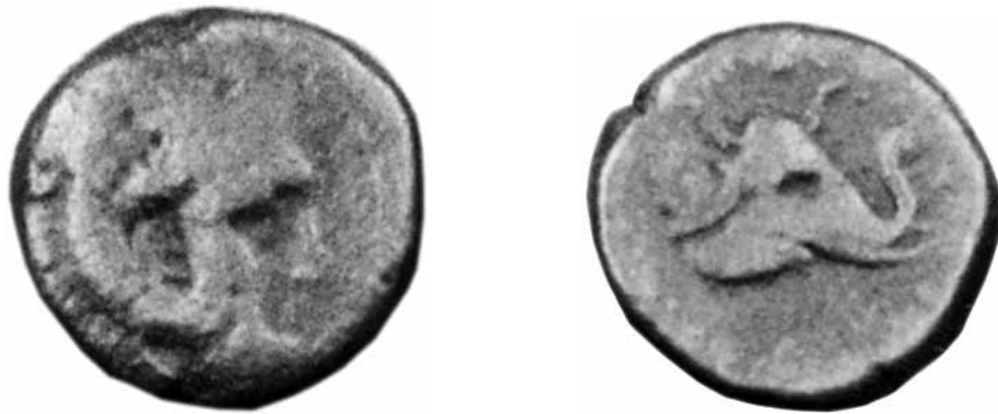
Figure 5. Head of young Heracles wearing lion skin/Horned elephant head (AE, Seleukeia on the Tigris, workshop II), SC 147.