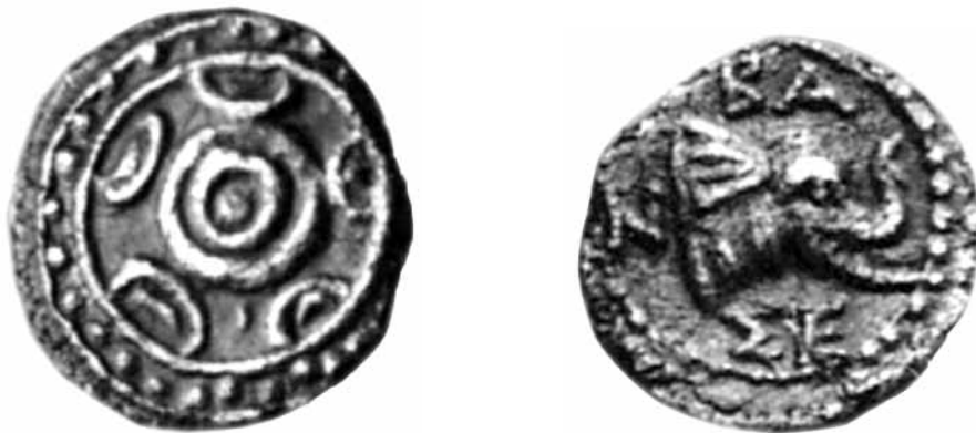
Figure 8. Macedonian shield/Elephant head (Silver hemiobol, Antioch), SC 14.