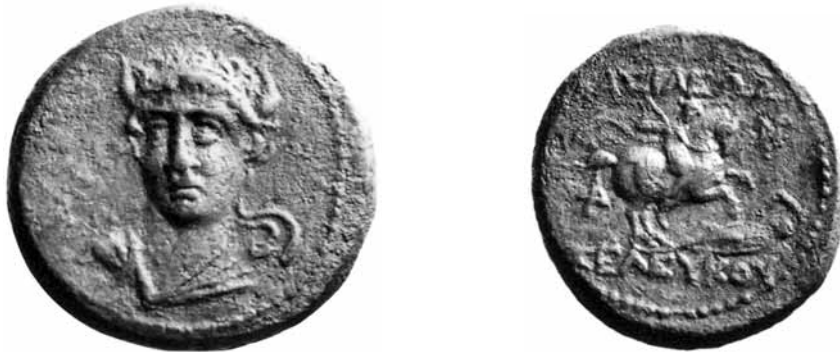
Figure 25. Horned bust of Seleucos II depicted three-quarters left/Horseman spearing fallen enemy (AE, Seleukeia on the Tigris), SC 767.