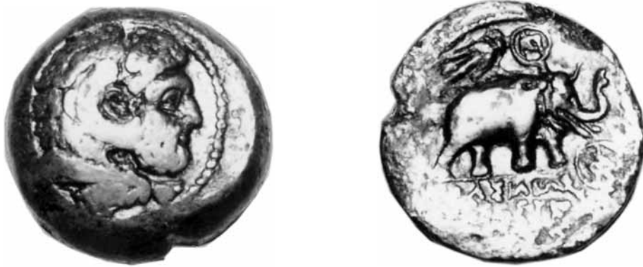
Figure 4. Bearded head of Heracles wearing lion skin/Horned and belled elephant (AE, Bactrian mint 19), SC 265.