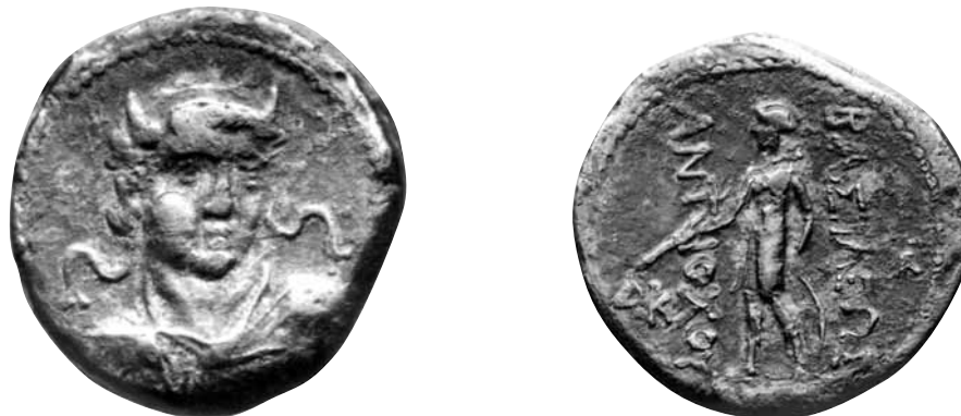
Figure 26. Draped and horned bust of Antiochos III depicted three-quarters right/Apollo standing left and resting left hand on bow (AE, Seleukeia on the Eulaios [Susa]), SC 1222.