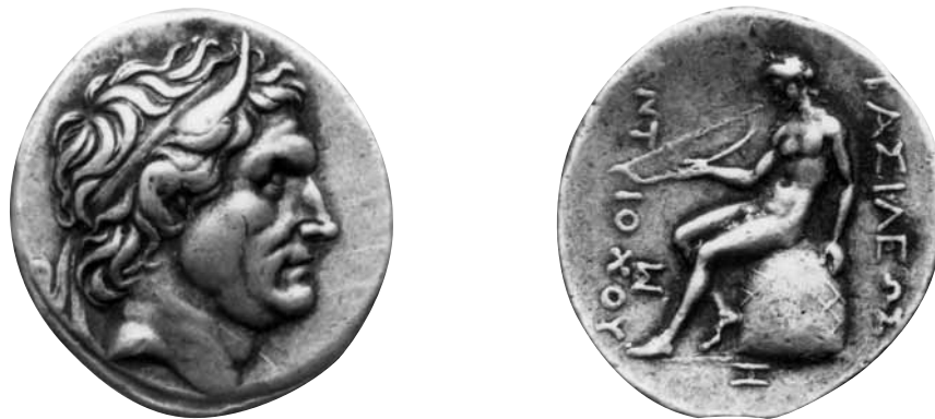
Figure 22. Horned head of Seleucos I/Apollo Toxotes seated on omphalos (Tetradrachm, Sardeis), SC 323.2b.