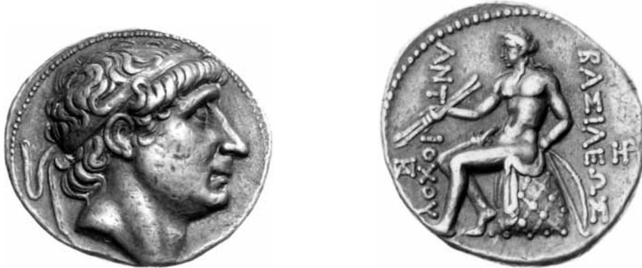
Figure 24. Diademed head of Antiochos I/Apollo Toxotes seated on the omphalos (Tetradrachm, Seleukeia on the Tigris), SC 378.1.