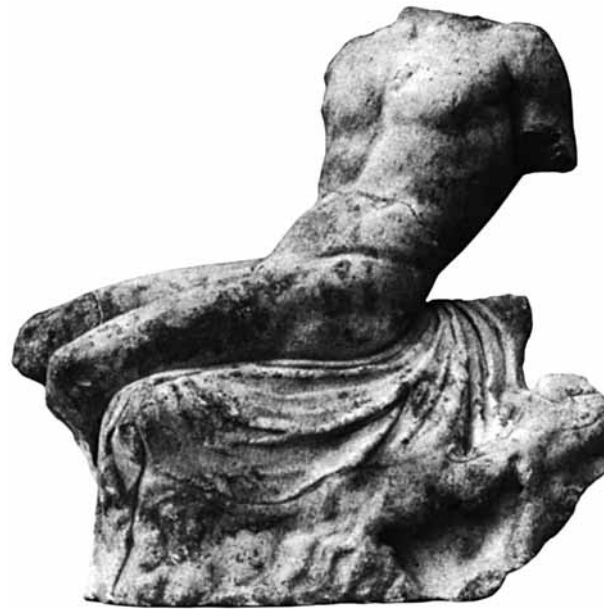
Figure 14. Headless statue from Olympia (Dionysos?), LIMC III/1, p. 439, no. 142.

reverse type of the coin, the horned head of an Indian elephant. The horns, adapted from the Mesopotamian tradition, are symbols of supernatural power and divinity for both human beings and animals. They mark the elephant of our coin as something more than an ordinary mortal animal; rather this is a supernatural elephant, almost divine 29 . Furthermore, in the Hellenistic world elephants remained closely associated with India: ancient sources refer to the use of almost exclusively Indian personnel charged with the training and driving of the elephants. This relationship seems to possess an almost mythical dimension which becomes clear when Aelian attributes to the elephants a natural mysterious ability to understand the Indian language 30 . Elephants, Dionysos, and India formed a tight symbolic nexus.