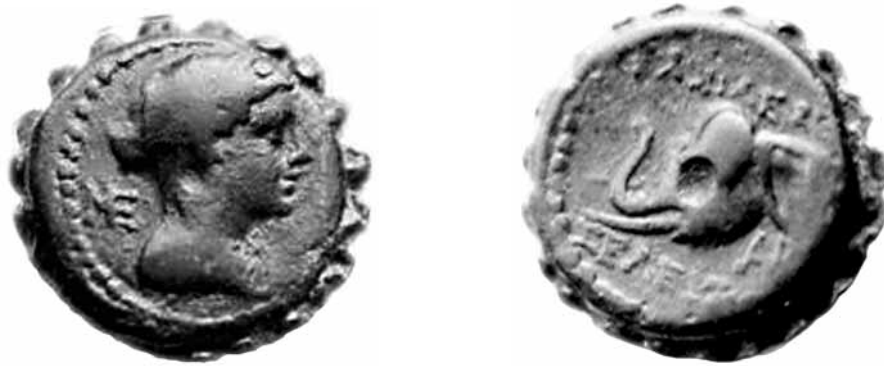
Figure 18. Veiled and diademed bust of Laodike IV/Elephant head (serrate AE of Seleucos IV, Antioch), SC 1318.1c.