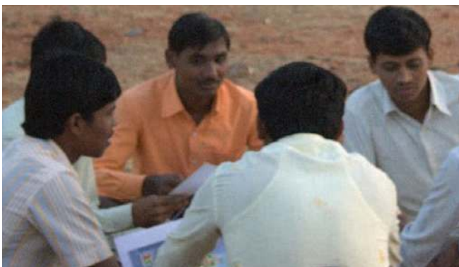
The Rural Entrepreneur Forms held by Head Held High

Companies like Head-Held-High ( www.head-held-high.com ) have brought to life the concept of creating multi-purpose rural hubs that train local youth in various kinds of business and employability skills, to be hired by corporations or local businesses wanting to access the regional markets. The network is also leveraged to service the various needs of local rural consumers by nurturing local entrepreneurs and connecting them to manufacturers and service providers from across the country. Two hubs have been piloted successfully by HHH in south India and 3-5 more hubs will be ready to setup across other states in south and central India. Bridging the gap between education and employment, Head Held High has a school dropout program and a graduate program for rural youth. The VEF - Village entrepreneur forum – holds various events, expert talks and networking events that bring the local entrepreneurs onto a single platform along with experts, mentors and peers they can learn from. Beyond serving as an effective engagement and knowledge platform, the VEF also helps keep the spirit of enterprise alive in the rural areas where youngsters feel empowered enough to come up with their own initiatives and ideas to tackle local challenges with the support of this ecosystem.