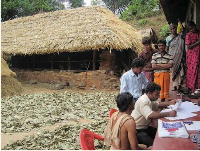
Access to social security, welfare schemes and even essential services has a long way to go in rural India. Pic: Welfare scheme enumeration in Odisha, Western India

of the key drivers. The problems emerging out of this phenomenon have been many - families either uprooted from native cultures or separated from one another; lack of life skills to adapt to an alien urban environment leading to lost opportunities; unstructured and uncontrolled growth in urban areas leading to social and environmental tensions and more.