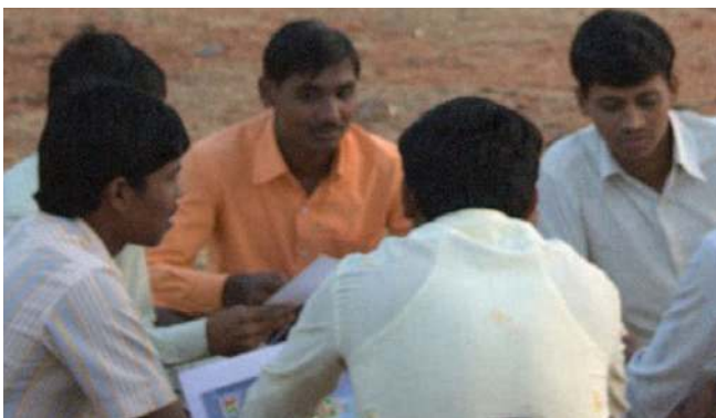
The Rural Entrepreneur Forms held by Head Held High

Companies like Head-Held-High ( www.head-held-high.com ) have brought to life the concept of creating multi-purpose rural hubs that train local youth in various kinds of business and employability skills, to be hired by corporations or local businesses wanting to access the regional markets. The network is also leveraged to service the various needs of local rural consumers by nurturing local entrepreneurs and connecting them to manufacturers and service providers from across the country. Two hubs have been piloted successfully by HHH in south India and 3-5 more hubs will be ready to setup across other states in south and central India. Bridging the gap between education and employment, Head Held High has a school dropout program and a graduate program for rural youth. The VEF - Village entrepreneur forum – holds various events, expert talks and networking events that bring the local entrepreneurs onto a single platform along with experts, mentors and peers they can learn from. Beyond serving as an effective engagement and knowledge platform, the VEF also helps keep the spirit of enterprise alive in the rural areas where youngsters feel empowered enough to come up with their own initiatives and ideas to tackle local challenges with the support of this ecosystem.