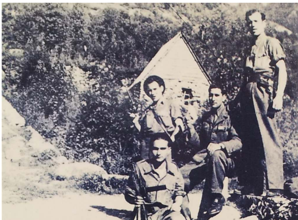
PICTURE OF MAQUIS' SOLDIERS DURING THE ARAN VALLEY INVASION, OCTOBER 1944, PROBABLY SHOT BY A PCE MEMBER.