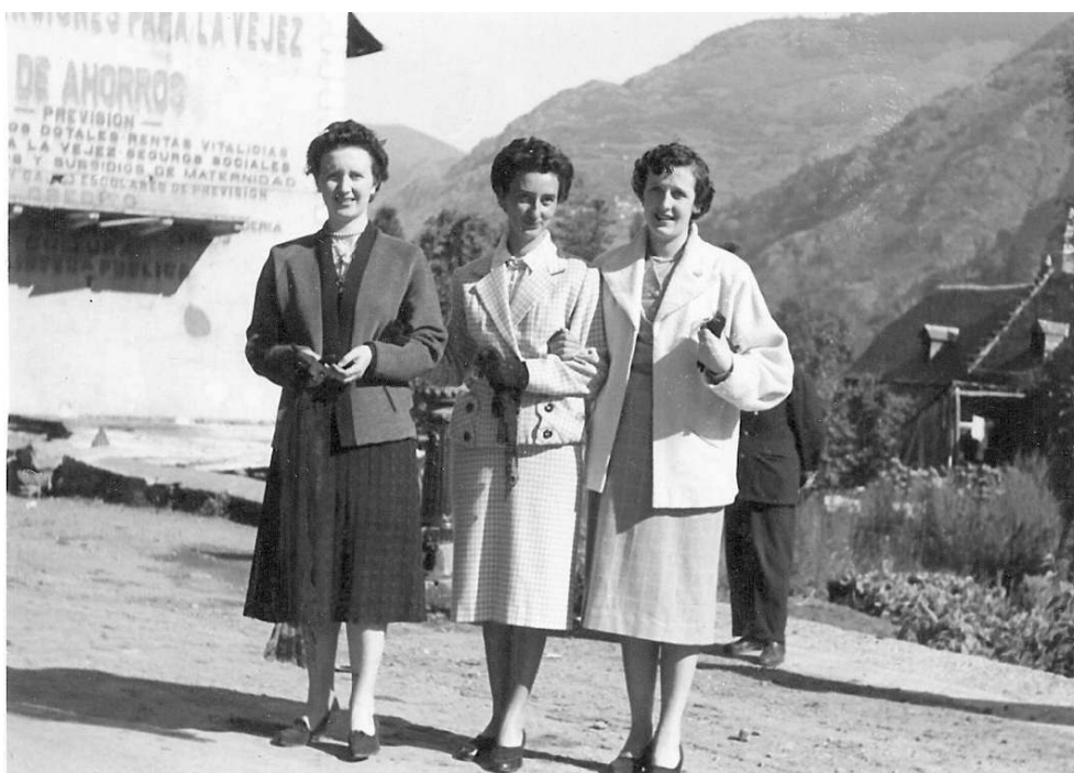
Picture of three women on the Baish Aran 40s, taken in Les, near the France-Spain border.