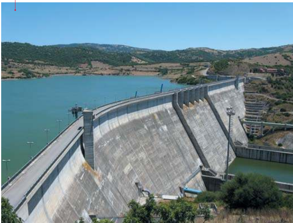
Cantoniera dam, on the Tirso, essential to Sardinia's water supply

But dams also have downsides: impacts on biodiversity, conflicts of use, risk of breach, and sometimes the displacement of local populations, arousing opposition. And indeed, every dam, hydroelectric or otherwise, blocks watercourses and constitutes an obstacle to the circulation of certain species (fish swimming upstream, notably migratory species such as salmon and eels) and sediments (sand, mud, etc.) which consequently build up and can concentrate pollutants in the reservoir. The absence of new sediments downstream of the dam can cause erosion problems that modify the aquatic environment, undercut riverbanks, or wash away beaches. Dams are therefore a double-sided coin, with a positive side (energy, drinking water, irrigation, flood regulation, river navigation, fight against drought, etc.) and a negative side (ecology, sediments).