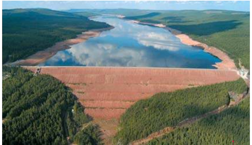
The Trångslet Dam in Sweden