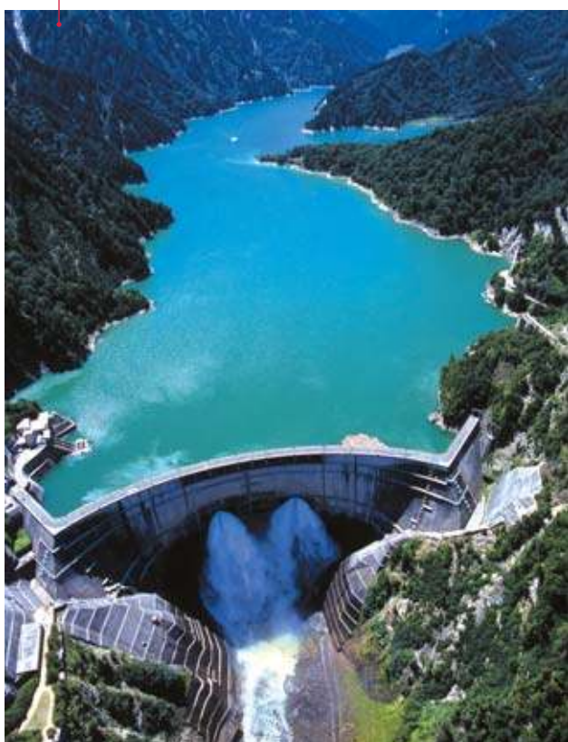
Kurobe Dam, in Japan, is designed mainly to combat flooding

Special care must be taken for vulnerable ethnic groups. Hence, the organization of the overall decision-making process, incorporating the technical design as a sub-process, should involve all relevant interest groups from the initial stages of project design, even if the existing legislation does not (yet) demand it.