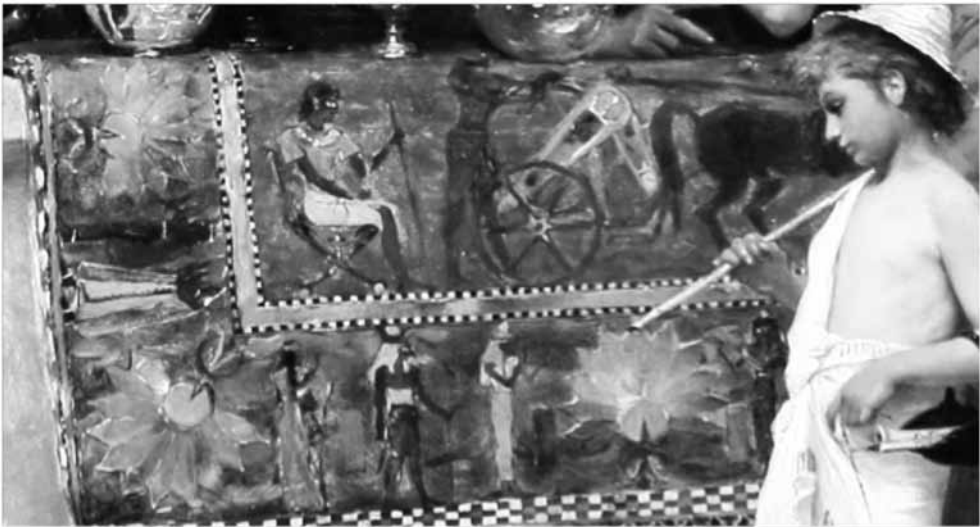
Fig. 18a. Capobianchi (detail)

We stay at the British Museum with the Egyptian carpet put on the counter since the main scene on a red background is made with two detached fragments (inv. BM EA 37979 and BM EA 37982) of the tomb of Nebamun (ca. 1350 BCE) located at Dra Abu el-Naga in the Northern area of the noble tombs of the Theban necropolis and acquired by the British Museum in 1821 (fig. 18a-c). 45