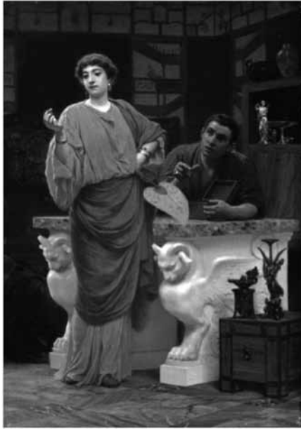
Fig. 7. Stefan Bakalowicz, Little luxury , no date but likely to be after 1880, oil on canvas, 51 x 37.5 cm (private collection)