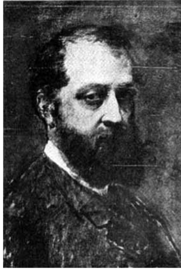
Fig. 2. Vincenzo Capobianchi, Selfportrait (see CARACCILO DEL LEONE, “Un artista e scienziato...”, p.21)

Very little has been published so far on Vincenzo Capobianchi (fig. 2), 2 a key figure in several respects who is still awaiting a true study. 3