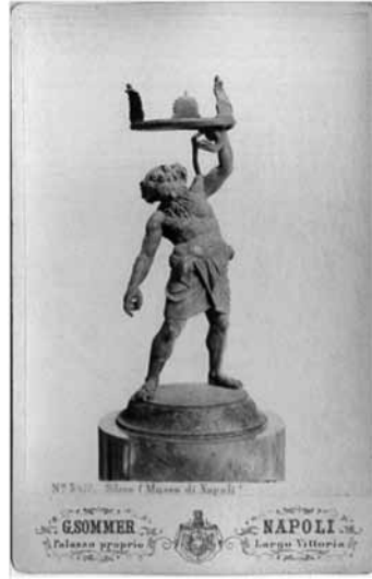
Fig. 20b. Bronze Silenus (Naples, Museo Archeologico Nazionale)

This spectacular bronze sculpture already appears in Greek wine painted in 1873 by Lourens Alma-Tadema, 48 as well as in different versions of sellers done by Ettore Forti. Comparing how these artists reproduced this bronze group, it turns out that Capobianchi's version will certainly not appear as inferior to the others.