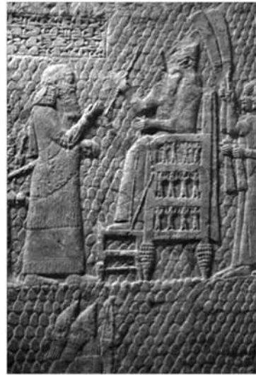
Fig. 16b. Relief from Nineveh, London (British Museum)

One finds below the even more famous wounded lioness (ca. 650 BCE) coming from the palace of the Neo-Assyrian king Ashurbanipal II (668-627 BCE), also acquired in 1856 from John George Taylor and excavated at Nimrud (fig. 17). 44