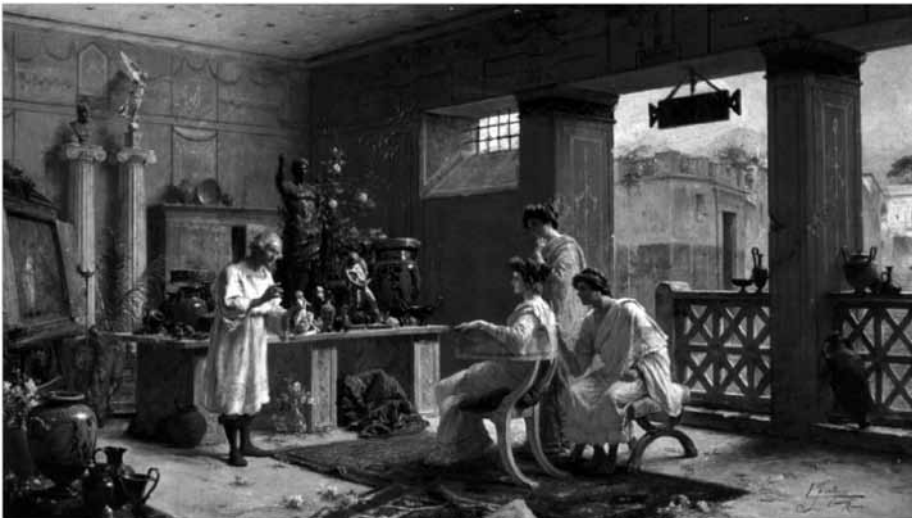
Fig. 10. Ettore Forti, At the antiquarian , private coll.