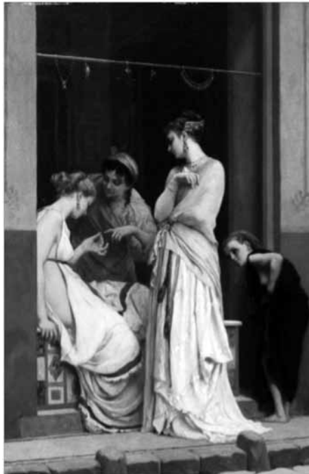
Fig. 4. Gustave Clarence Rodolphe Boulanger, Une marchande de bijoux à Pompéi , 40.6 x 25.1 cm (private coll.)