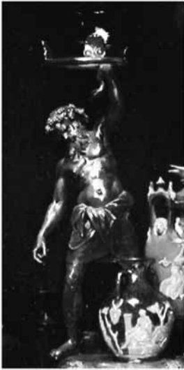
Fig. 20a. Capobianchi (detail)

Vincenzo Capobianchi also included in his composition the famous bronze drunken Silenus as an oil lamp base, found in Pompeii in 1863 (inv. NM 5628) and immediately reproduced as a suitable souvenir to be brought back home by the elite doing their Grand Tour (fig. 20a-b). 47