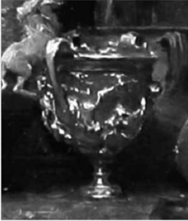
Fig. 21a. Capobianchi (detail)

of the National Museum of Naples. 49 The cup is reputed to have been found in Pompeii during the years 1870-1880 (fig. 21a-b).