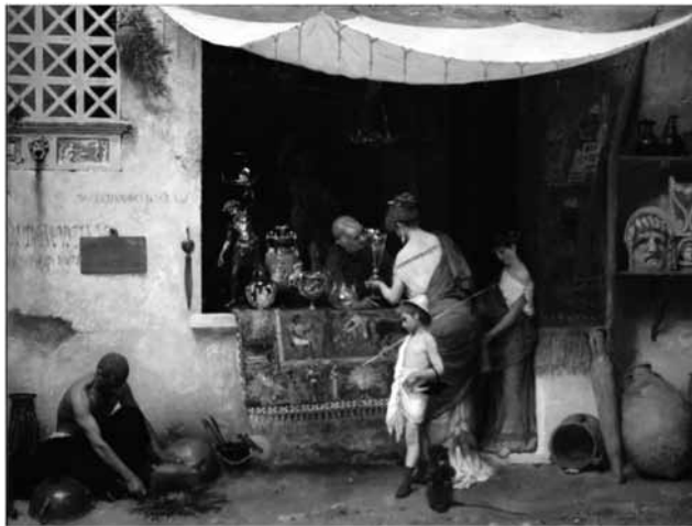
Fig. 1. Vincenzo Capobianchi, Il venditore d'antichità , 1880, oil on canvas, 65.4 x 43 cm (Staffoli [Pisa], private collection)