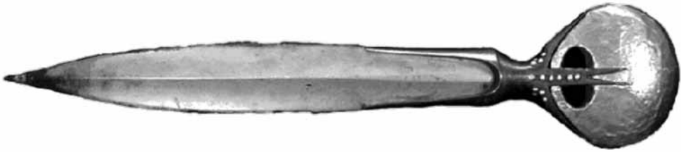
Fig. 15. Dagger of Kamose (Royal Library of Belgium, Lucien de Hirsch coll.)