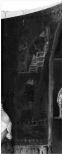
Fig. 16a. Capobianchi (detail)