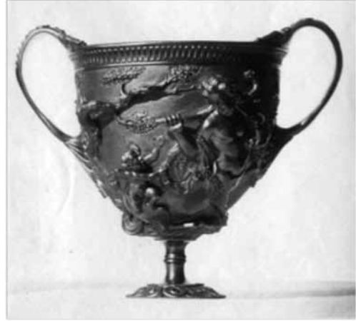
Fig. 21b. Silver cup from Pompeii (Picture by Giorgio Sommer; private coll.)