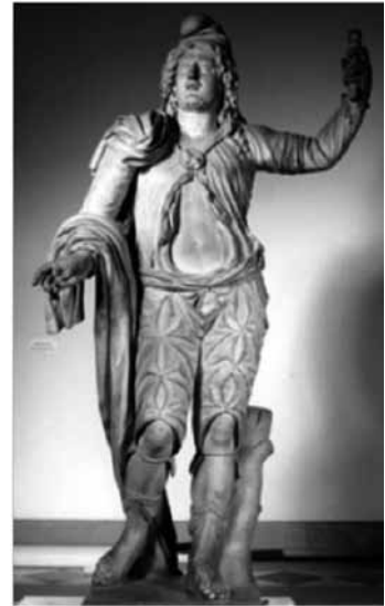
Fig. 23b. Sculpture of Attis, Florence (Uffizi, inv. 1914, nr. 84)

Emerging from the dark of the inner shop, one recognizes the 3 rd c. CE colossal statue of Attis restored in 1712 as a barbarian king (the head), now displayed at the Uffizi Gallery in Florence and since long the possession of the Medici. 51 But whereas the original is a colossal marble sculpture, its bronze replica has been here downsized (fig. 23).