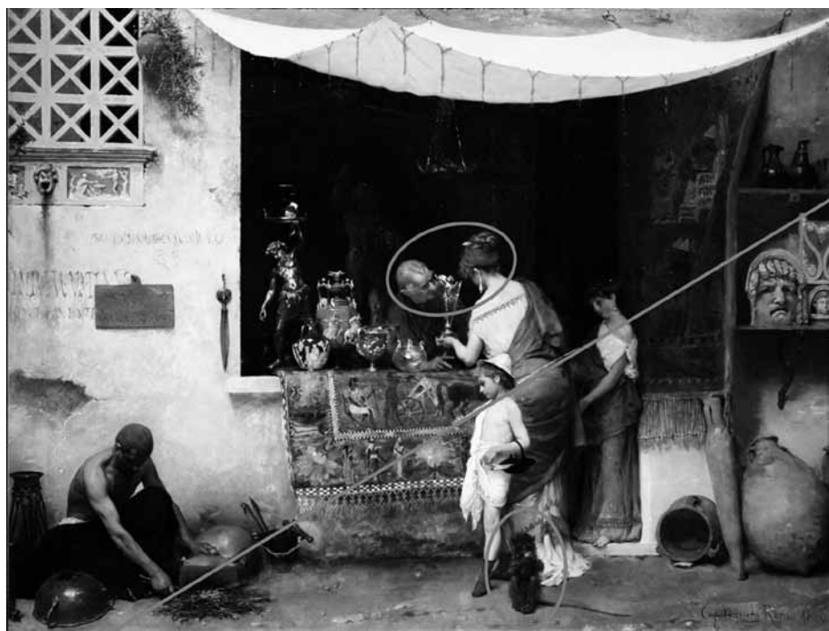
Fig. 14. Il venditore d'antichità

The work is built with two dominant points: a central area marked by the object of the sale, the small bronze Nike, intensely looked for by the two main characters, the buyer and the seller, and a perfect diagonal line which is starting with the repaired pot of the blacksmith at the bottom left and is going through the cane of the boy to end above with a theatrical mask which is likely to play a role in this social satyr of an unbalanced world where the high living standards of the elite in the center are made possible by the hard work of foreign slaves at the periphery.