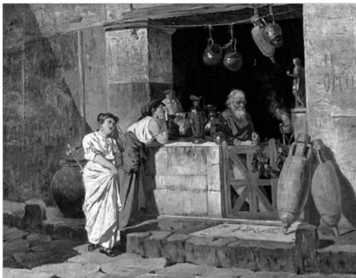
Fig. 6. Enrico Salfi, Il venditore di anfore a Pompei , 1880, Milan