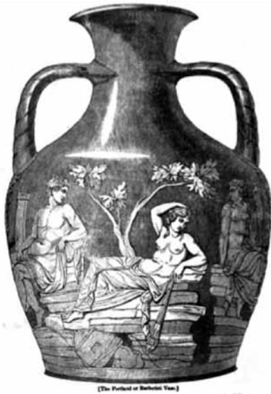
Fig. 19. The Portland Vase (from The Penny Magazine , 29 Sept. 1832)

However, today's most famous piece depicted on Il venditore d'antichità is no other than the Portland Vase. 46 Allegedly found at the end of the 16 th century, described by Peiresc in 1633, this gigantic cameo vase long belonged to the Barberini family before being sold to William Hamilton in 1778. It was then bought in 1784 by the Duke of Portland and stayed in the family to be finally purchased in 1945 by the British Museum (fig. 19).