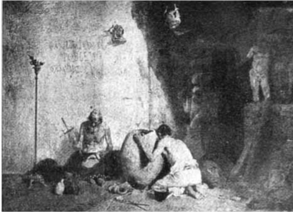
Fig. 3. Vincenzo Capobianchi, Il fabbricante di vasi (CARACCILO DEL LEONE, "Un artista e scienziato...", p. 25)

likely to have been produced shortly after 1880 as with The little luxury (fig. 7) of Stefan Bakalowicz (1857-1947) or At the bazaar of Emilio Vasarri (1862-1928) (fig. 8).