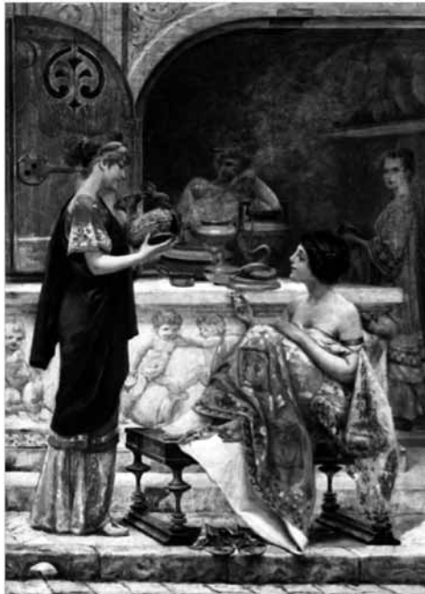
Fig. 8. Emilio Vasarri, At the bazaar , no date, 74.2 x 57 cm