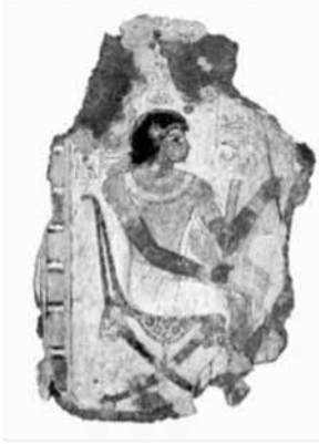
Fig. 18b. Egyptian relief (British Museum, EA 37979)