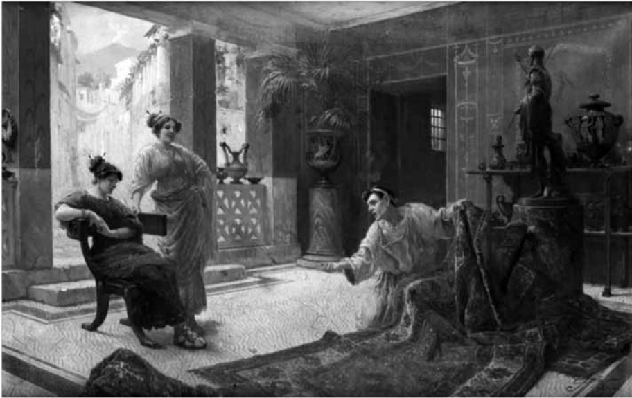
Fig. 9. Ettore Forti, Il mercante di tappeti , no date but likely to be after 1880 (sold by Bonhams on Sept. 29th, 2010)

But the absolute champion of this genre is certainly Ettore Forti about whom nearly nothing is known, except that he was active in the years 1880-1920. He literarily specialized in this sub-genre, producing many variants for each of his compositions in a clear Pompeian context, with depiction of the Vesuvius in the background. Fig. 9-11 are just a few examples of his extensive production.