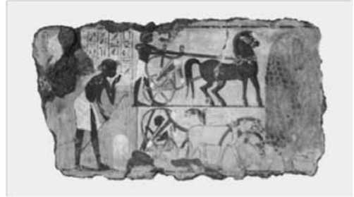
Fig. 18c. Egyptian relief (British Museum, EA 37982)