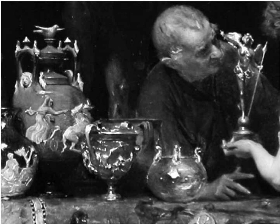
Fig. 24. Il venditore d'antichità (detail)

The two other pieces put on the counter are harder to identify precisely (fig. 24). Starting from left to right, one recognizes: 1) a Hellenistic plastic vase ( askos ) from the Canosa group painted with flashy colours, 52 and 2) an undecorated jug of red ware lacking distinctive characteristics. Finally, the elegant buyer is holding in her left hand a gilded Nike extending her right arm and holding a spear in her left.