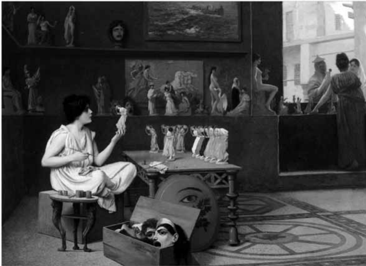
Fig. 12. Jean-Léon Gérôme, Painting Breathes Life into Sculpture , 1893, Toronto

Alma-Tadema himself never really pictured an art dealer scene, even if he sometimes went not too far as with The flower market which is depicting a presumably anachronistic street shop of a flower seller (fig. 13).