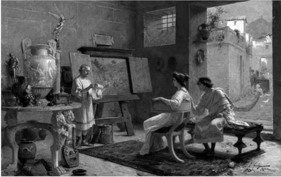
Fig. 11. Ettore Forti, The art lesson , private coll.

It is noticeable that, in the examples provided above, the seller of antiquities is always a man and the buyer always a woman. Gender studies may easily find a way here along the line argued by Joseph A. Kestner: classical revival painting vehicles a strong reaction against gender claims, reaffirming the traditional roles attributed to women, the touch of frivolity included. 39 There is not only a gender dichotomy between sellers and buyers. It is furthermore noticeable that buyers are only young and beautiful women while sellers are mostly old and unattractive men. One is encouraged to recognize the old prevention of Christianity against money as a corrupting agent (think to the many depictions of money-lenders or of the allegory of avaritia ).