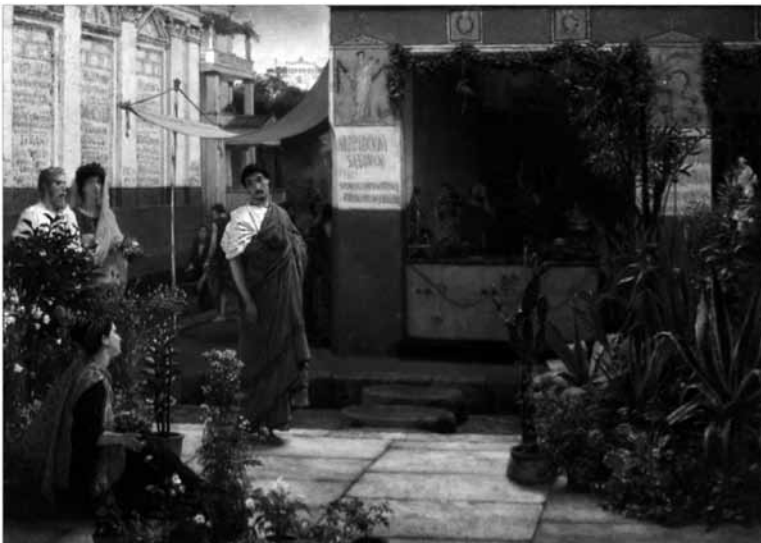
Fig. 13. Lourens Alma-Tadema, The flower market , 1868, Manchester

Alma-Tadema himself never really pictured an art dealer scene, even if he sometimes went not too far as with The flower market which is depicting a presumably anachronistic street shop of a flower seller (fig. 13).