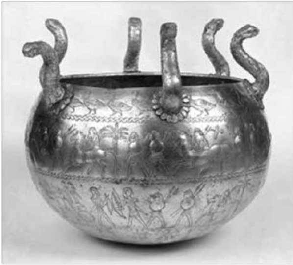
Fig. 22. Caldron of the Bernardini tomb, Rome (© Museo Nazionale di Villa Giulia, inv. F3 686)