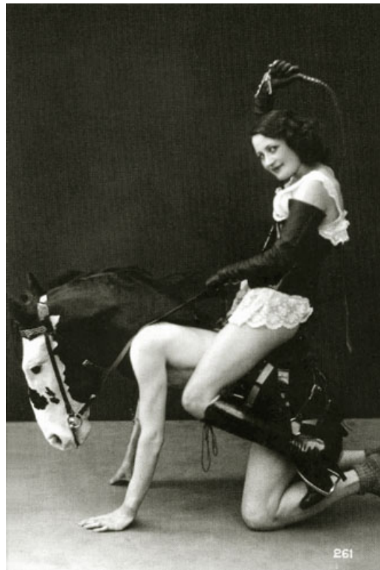
Fig. 1: Pony Play. Biederer Studio, Paris, 1930's Photographer, Jacques Biederer

chains and clamps, and removes the uniform...and switches off the lights, and leaves the studio for home, she may be discarding cruelty and torture. But the uniform stays there behind in the dark, waiting for someone to change into it and thereby bring it back to life. Will it be she or an actual policeman? Is the whip waiting for just another working day in the world of S&M or for a return to reality? In a world where identity is increasingly played out as simulated identity, and controls become increasingly erotic, maybe no one will know the difference. And maybe there is no difference. (Noyes 221)