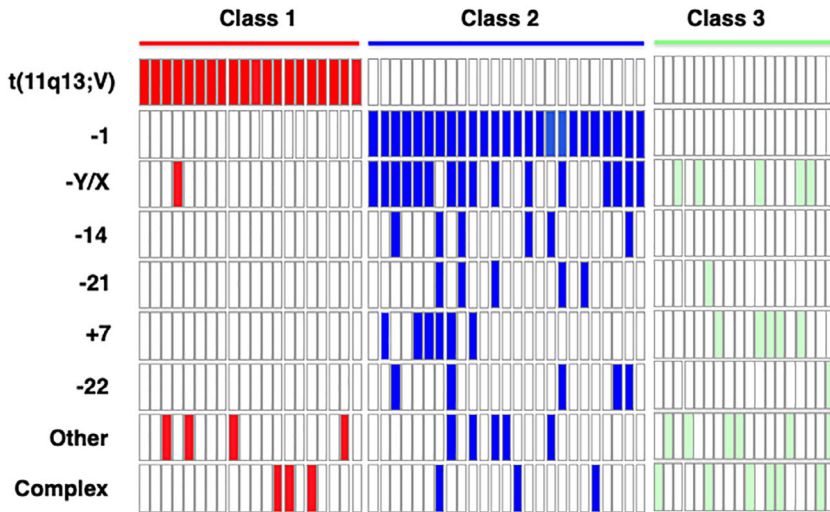
FIGURE 1 Patterns of chromosome abnormalities in various classes of renal oncocytomas. Red, class 1; blue, class 2; light green, class 3. Light blue in class 2 indicates partial deletion of chromosome arm 1p