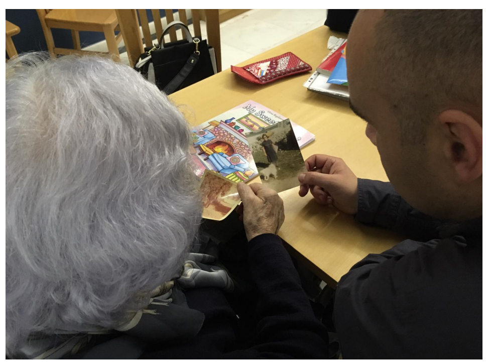
Figure 1: Grandma and me, talking about old pictures (February 2019)

Reflecting on the serendipity of encountering these two nested families, discussions with colleagues recalled personal memories. From the outset, I had an image of the locale where these two families currently live. My maternal grandmother frequently talks about this place. Her father was the tenant of a small plot of land, and she spent most of her childhood in a nearby village. Often, she recollected her own experience of poverty and deprivation from the early 1930s. Sometimes, when her father went there to plough or reap the field, he would gather shellfish from the shore. Grandmother also recalls the rare delight of eating fresh mussels with lemon and garlic. However, her memories of wholesome and straightforward country food, going back more than 75 years, are exceptional and interspersed with numerous accounts of scarceness. Since then, a lot has changed. Subsistence agriculture and rural work are obsolete. While horticulture remains a significant economic activity in the area, most locals work on services and commute to the county seat or Lisbon.