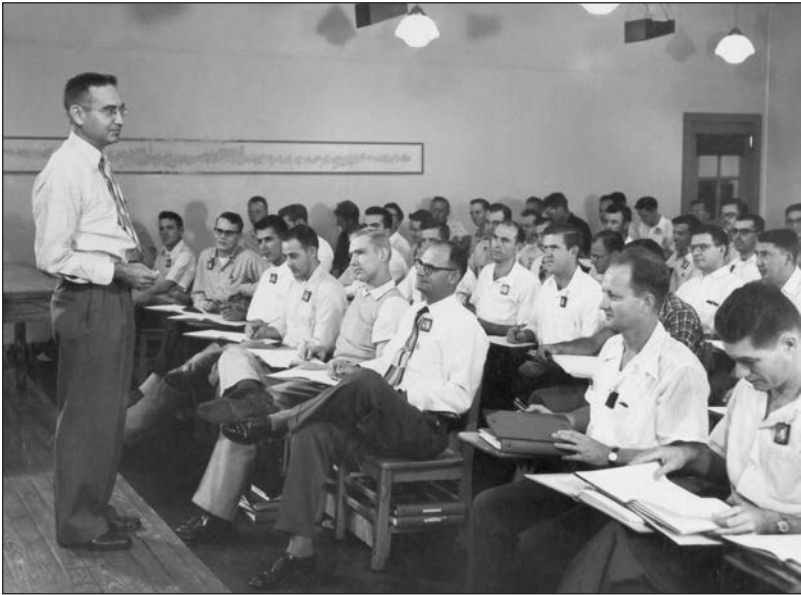
FIG. 1 Alvin Weinberg teaching at the Oak Ridge School of Reactor Technology, 1954.

cine. Its lab facilities, traveling speakers, and graduate-training program disseminated atomic expertise to the first generation of postwar technologists. 11