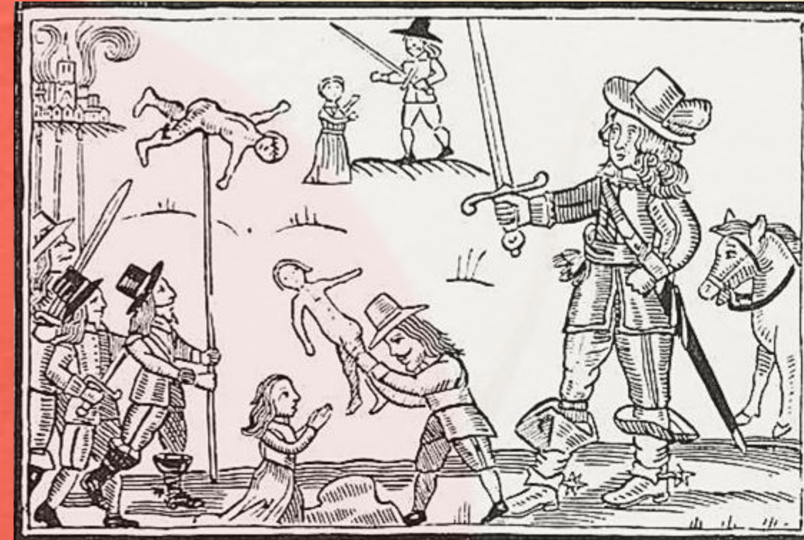
Bridgeman Education, Cruelties of the cavaliers, 1644 , LLM3629270

Reconstructing and understanding life in a garrison town during a civil war is difficult. By combining documentary evidence with material culture, images, and the sounds and smells of life it is possible to understand the continuity and discontinuity of Nottingham.