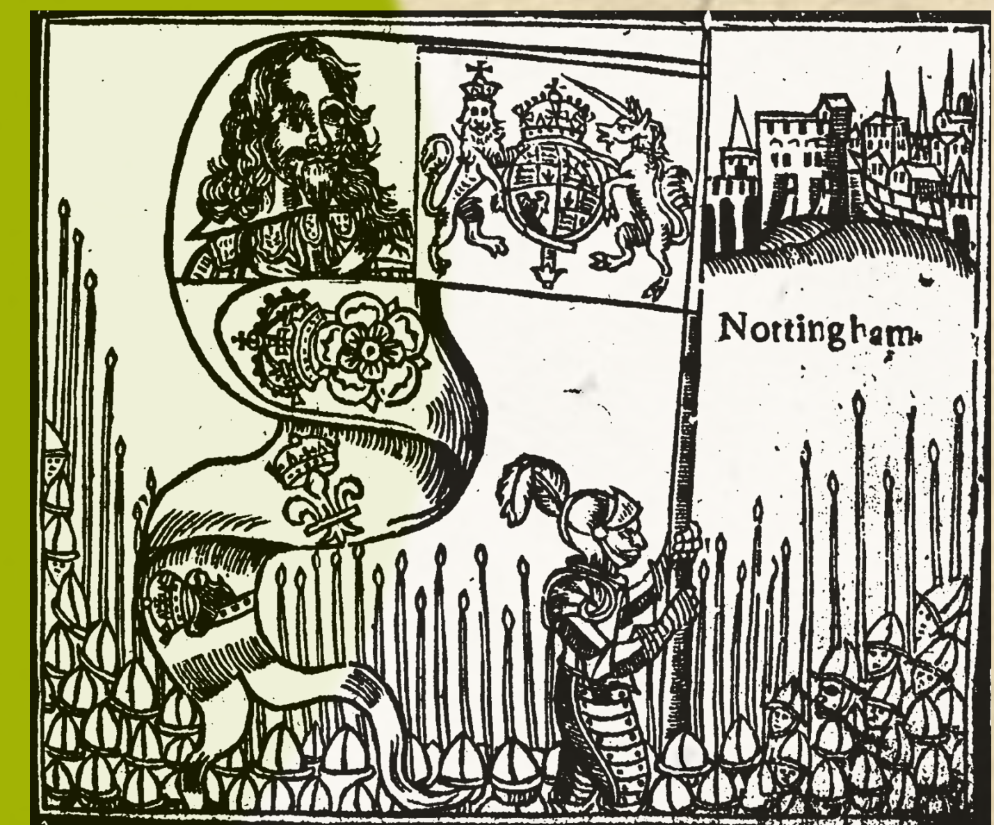
British Library, Thomason Tracts, A true and exact relation of the manner of his Majesties setting up of his standard at Nottingham, E. 115 (4)