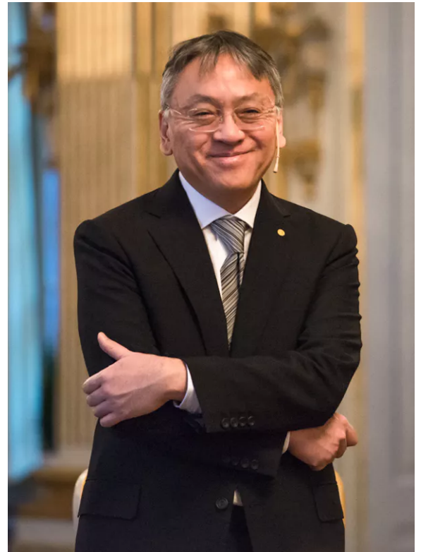
Kazuo Ishiguro.