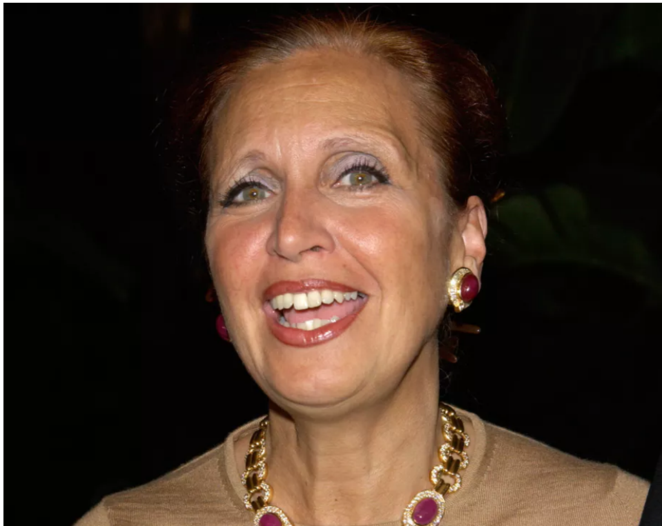
Romance is officially dead.