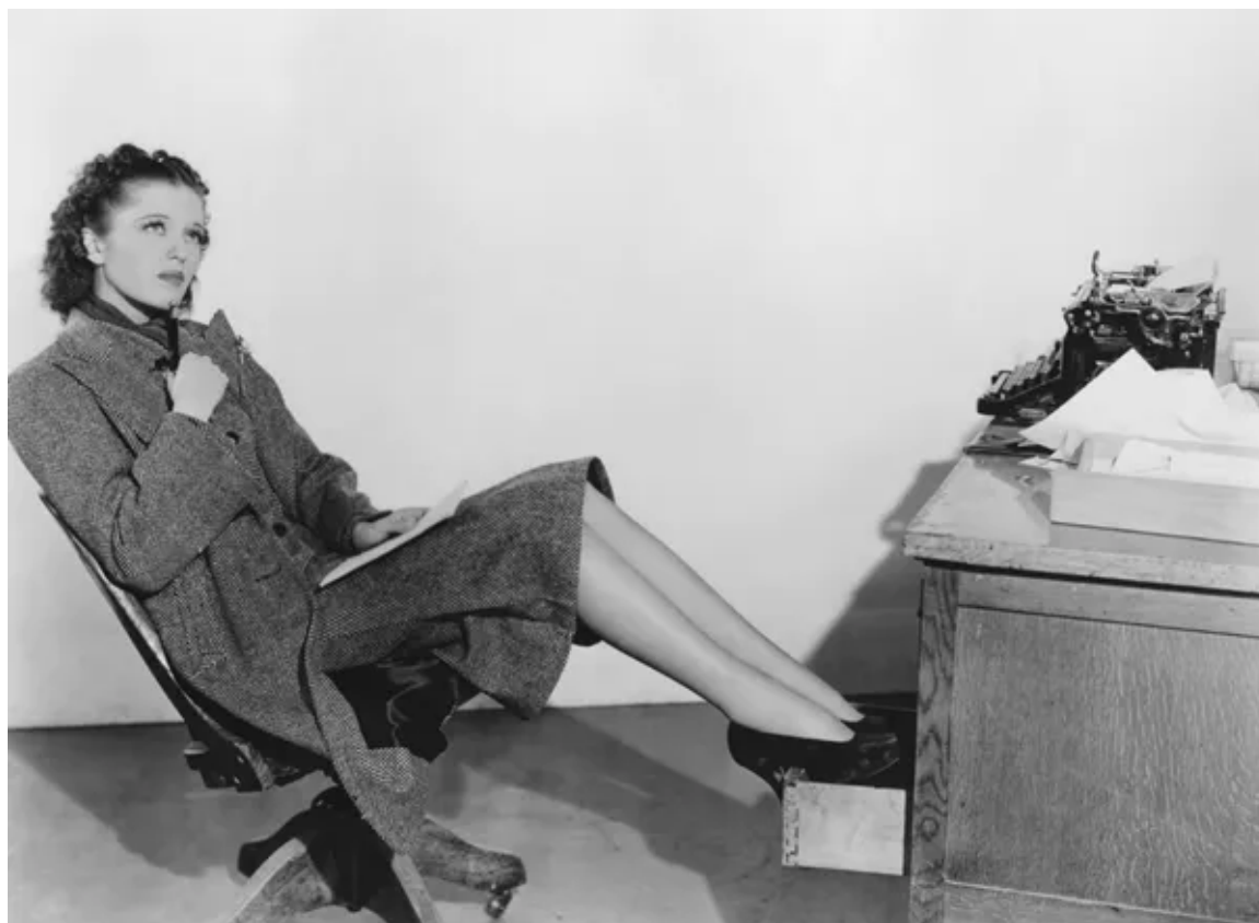
'Where did I put that dog?'

The act of not writing is just as important as writing. Never underestimate the importance of staring out of a window or going for a walk. All too often the knottiest story problems can only be untangled by getting away from the desk. If all else fails, try going to sleep and letting your subconscious do the heavy lifting. It's amazing how often the resting mind can resolve a problem your active thoughts couldn't fix.