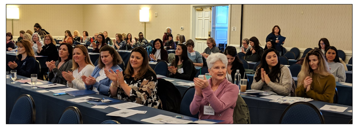
Early birds file in for opening day and the first guest speaker.