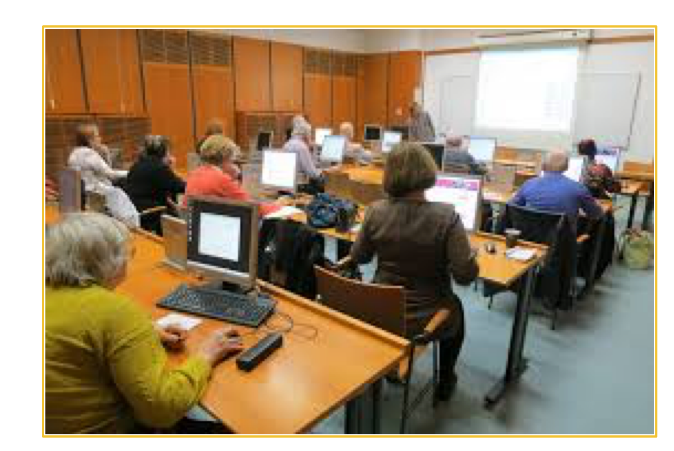
Digital Literacy classes will benefit community members of all ages.

Another change libraries are making is the societal advances they are making. Libraries are allowing readers to do a self-checkout system. This allows library users to have a quick and efficient way to acquire books and return them. To slow things down, many libraries are inserting cafes and bakeries. This allows readers to enjoy their book along with a snack and refreshment.