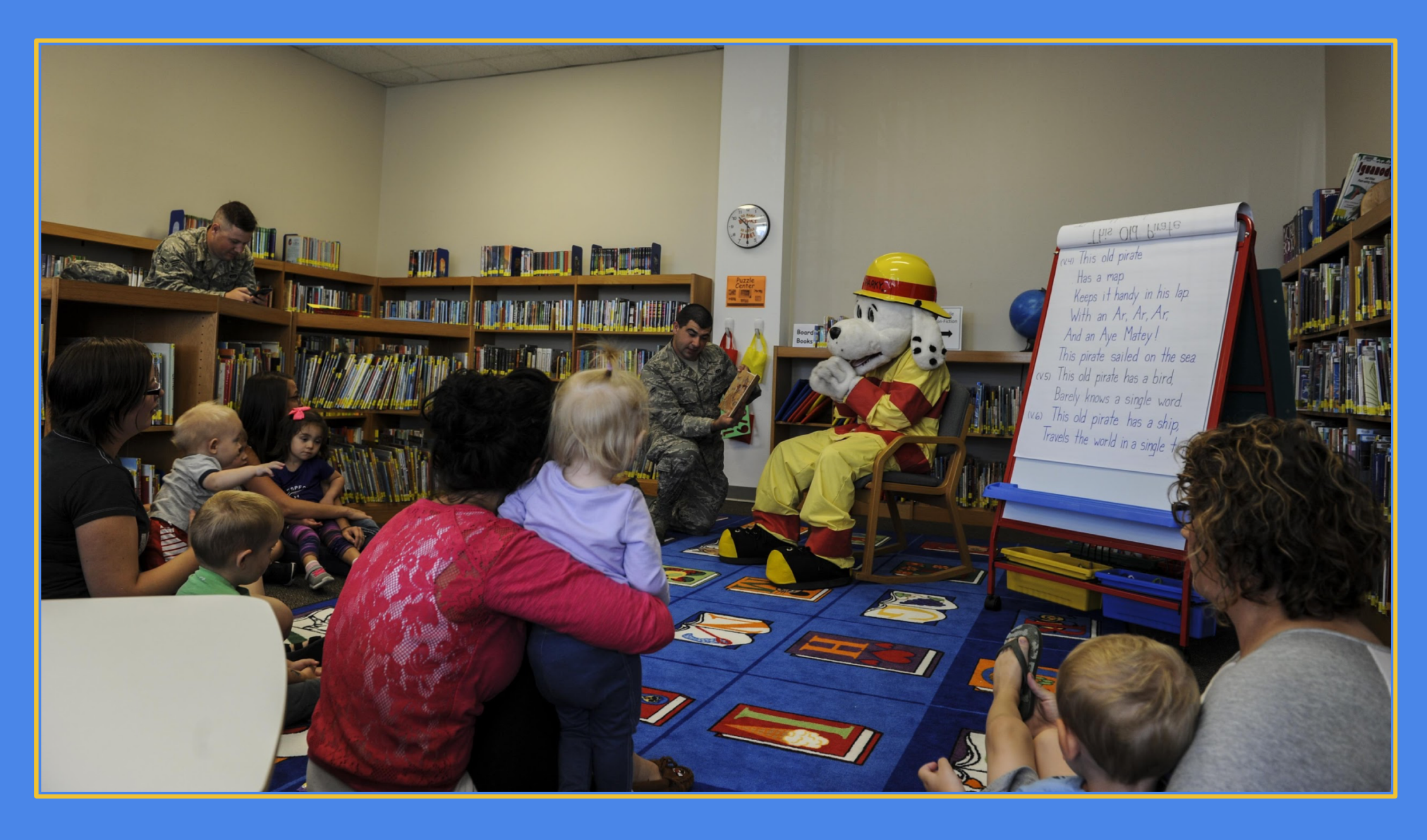
Community partnerships such as the fire department will promote both the library and local businesses.

Libraries, in an era where technology and the internet is becoming a staple in many people's lives, are often not the center of attention for many communities. This has led to fears that libraries could begin to disappear over the next two decades. Community involvement with local libraries will help to counter this trend. Therefore we urge libraries to increase the amount of community based activities that are hosted by libraries, and at the same time, urge communities to increase their participation with libraries. In creating a mutually beneficial relationship between libraries and communities, we may increase the longevity of these facilities.