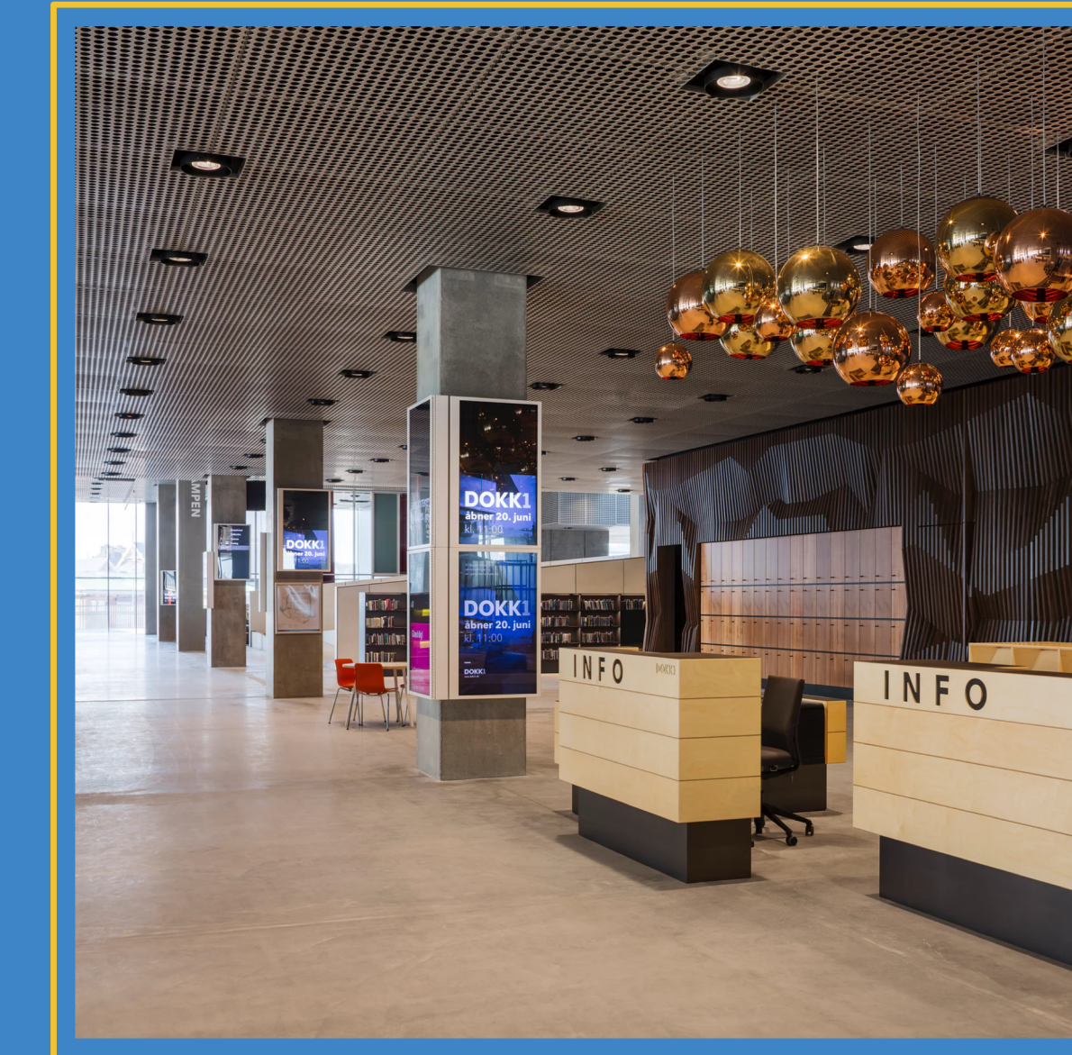
Dokki Library in Denmark

While usage and services are increasing, funds are decreasing