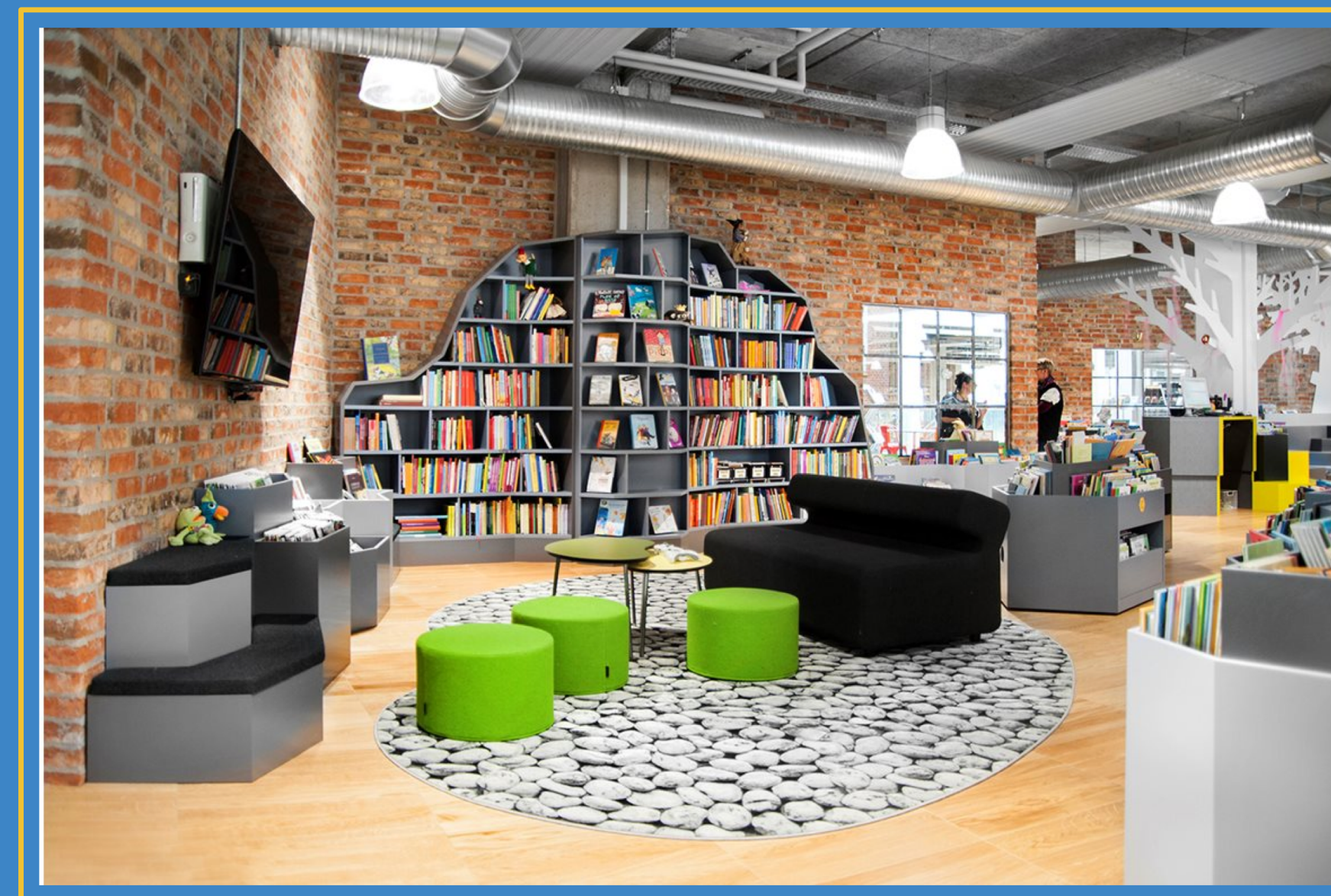
Herning Public Library in Denmark