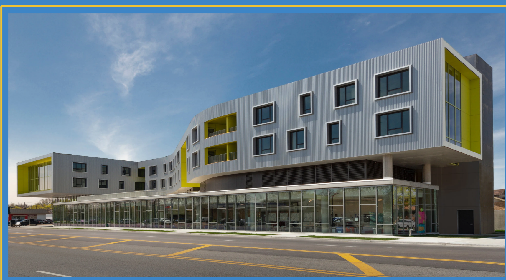
The Northtown Affordable Apartments and Public Library in Chicago