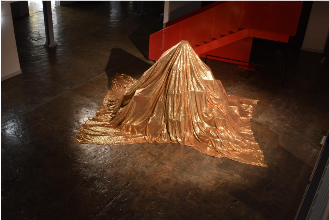
Figure 7. Tammy M. Burke. Exponential. Sequined fabric, cardboard boxes, vintage Fresnel lights. 12 feet X 16 feet X 8 feet. 2018.

documentation evidences object history and hopefully enacts desires for sensations.