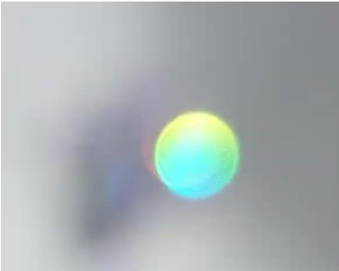
Figure 6. Tammy M. Burke. Still from Sparkle vids. Video projection. 8 in. x 10 in. 2019.

not only with sparkling things, but any alluring thing, the thing that is pursued (figure 6).