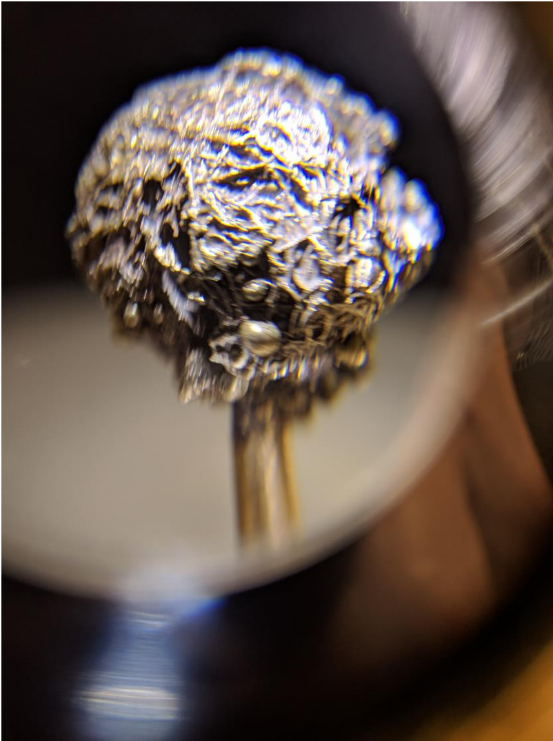
Figure 4. Tammy M. Burke. Display Cabinet #2, detail. 2019.

production: concerned less with absolute origins than with obscure traces.” 25