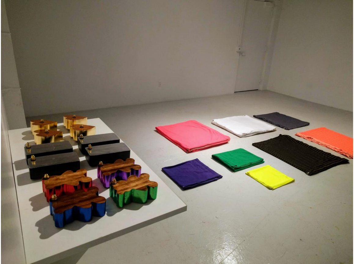
Figure 6. Tammy M. Burke. Indulge in Avoidance. Synthetic and natural fabrics, brass grommets and hardware, wood, melamine. Dimensions variable. 2018.