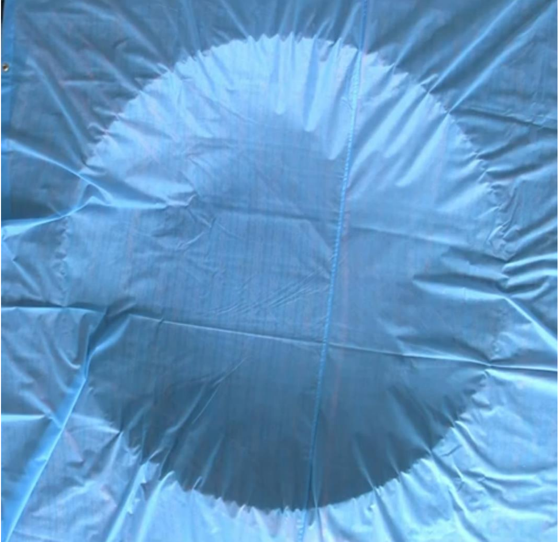
Figure 5. Tammy M. Burke. Still from Tarp video #1. Video projection. 8 ft. x 8 ft. 2019.