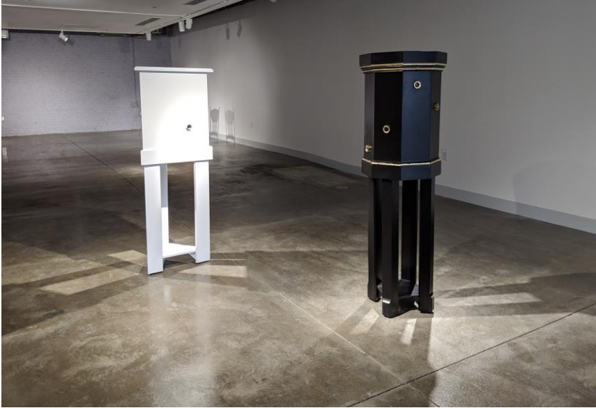
Figure 2. Tammy M. Burke. Display Cabinets #1 and #2, installation view. 2019.