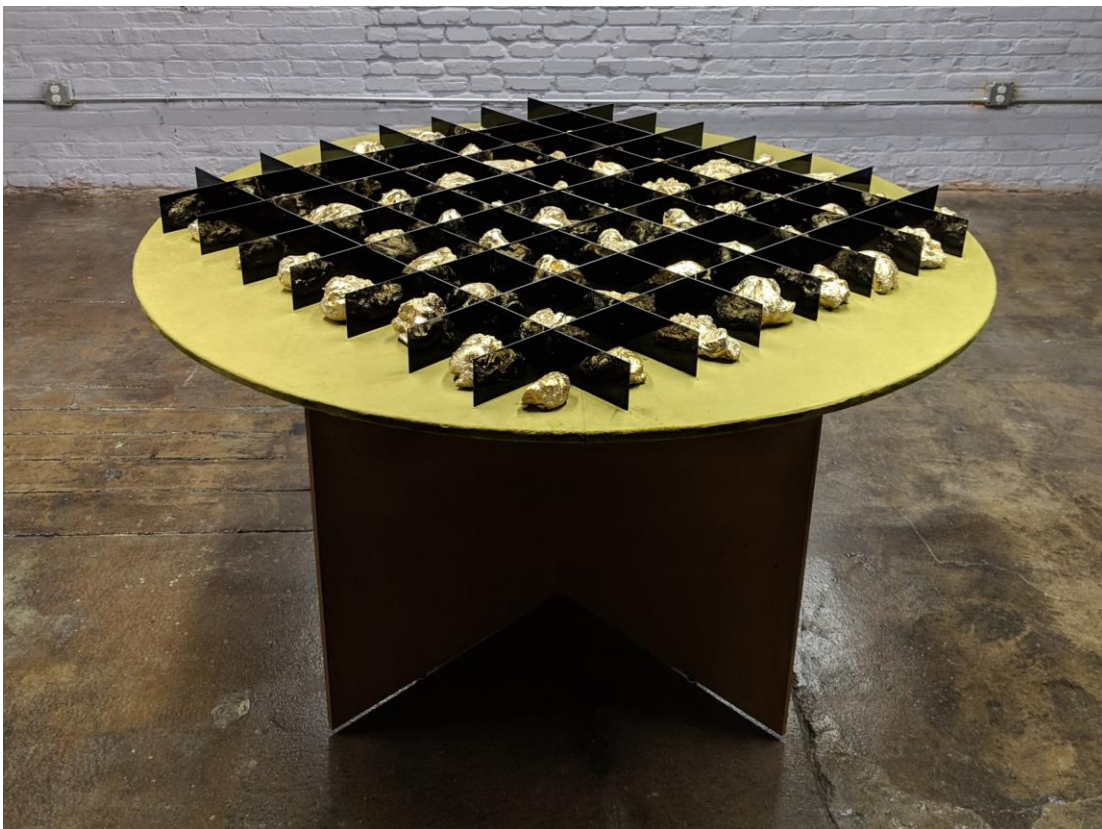
Figure 1. Tammy M. Burke. Secondary Market Display . Salt dough, imitation gold leaf, acrylic, minky fabric, mdf. 64 inches X 35 inches. 2018.

realm of actual movement into one of magical animation. Walter Benjamin described art's transition from magical ritual objects to political exhibition-focused objects as a result of mechanical reproduction, especially in film. 21 The coupling of the original objects (the tarps) and their recorded performances touches on both. They are now artifacts as well as art objects. Dorothy's ruby slippers at the Smithsonian Museum of American History, from The Wizard of Oz , worn by Judy Garland, are an example of object power rooted in history, contagion, and the meaningful record of their use. 22 Of course, the movie's impact is of utmost importance. If the movie had been lackluster, no one would care.