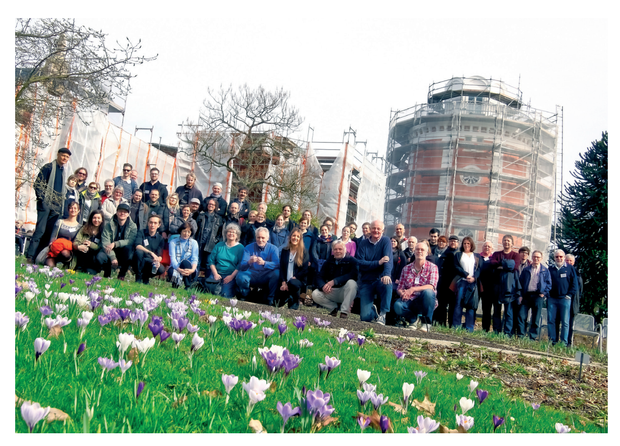
Fig. 1 Group photograph of the attendees of the 26th Mesolithic Conference in front of the venue in the Botanic Garden, Hardt Park, Wuppertal (Photograph: M. Koke).

Austria, Czech Republic, Britain, and Denmark – attended this international meeting (Fig. 1). The paper at hand is based on the abstracts of the research presented during the Mesolithic conference. The speakers mentioned in the texts are the authors of their respective abstracts. This paper therefore aims to give an insight into the diverse international programme of the conference which will be published in more detail in conference proceedings in the summer of 2018.