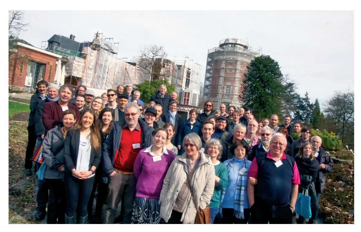
Fig. 7 Another Group photograph of the attendees in front of the venue.

(2009). Genetic Discontinuity Between Local Hunter-Gatherers and Central Europe's First Farmers, Science 326, 137–140.