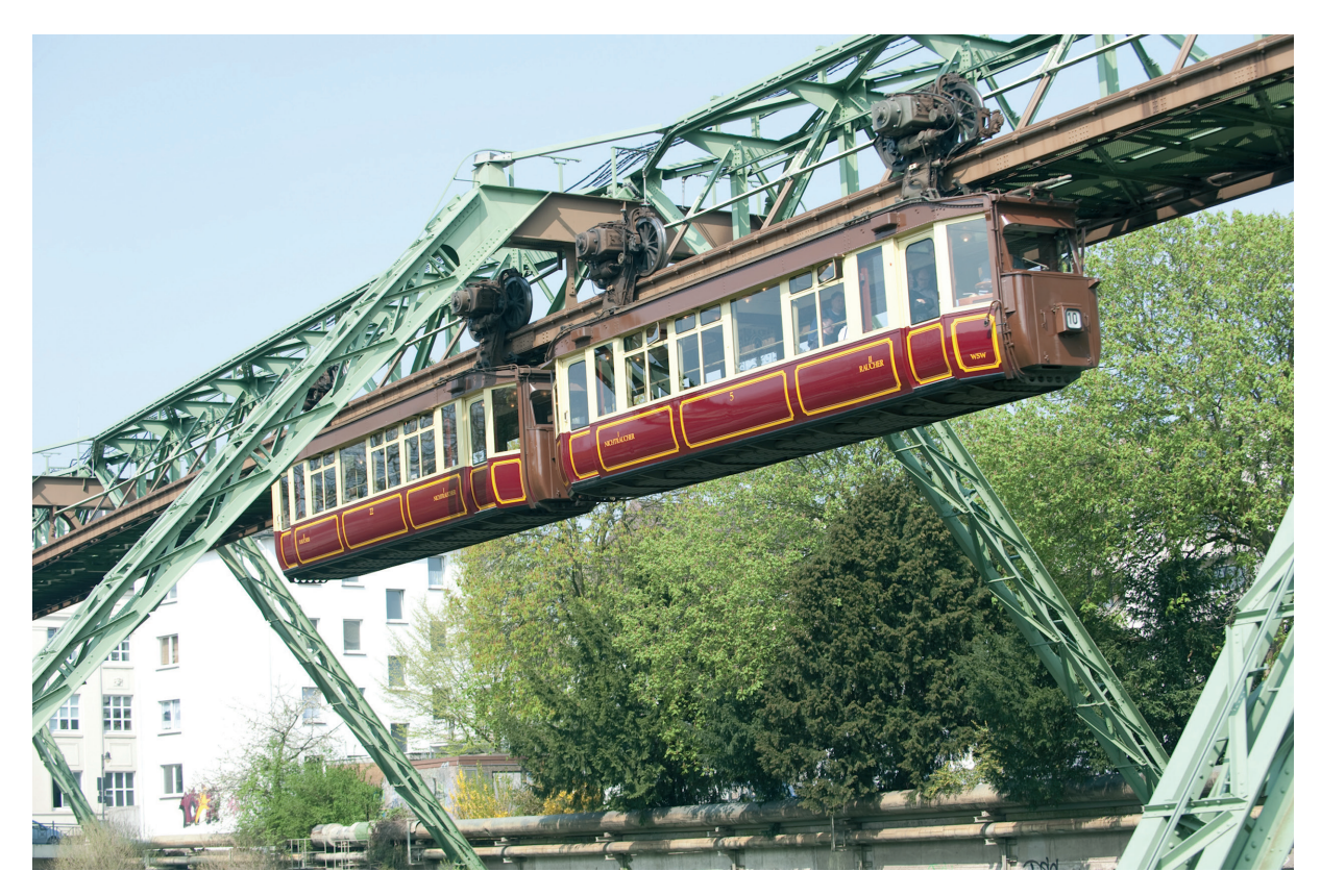
Fig. 2 The "Kaiserwagen" of the suspended railway in Wuppertal which is unique in the world.

suggested that the Long Blade phenomenon should be regarded as a last Palaeolithic phenomenon of probable early Holocene dating. (M.S.)