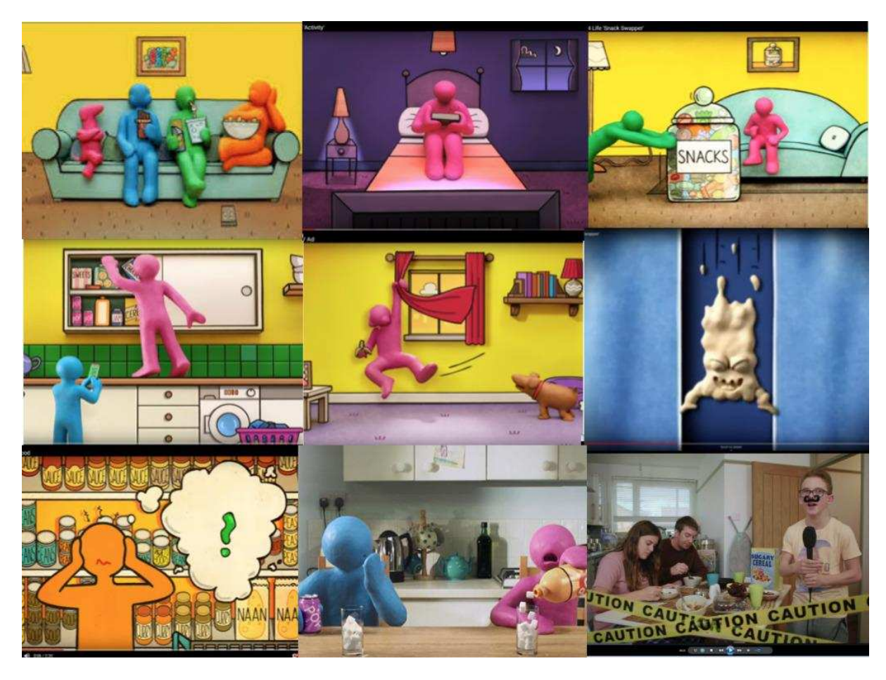
Figure 1. Screen shot images from the C4L campaign adverts