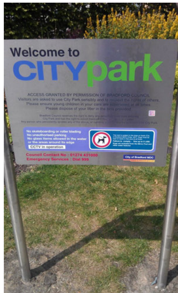
Figure 4.1 City Park's rules and regulations

The main rule that has been introduced relates to the use of glass items in and around the Mirror Pool given the danger this presents to children playing in the water. Dogs are to be kept on leads at all times and are not permitted in the Mirror Pool. Young children are expected to be supervised at all times by their guardian mainly due to the risk presented by the water. More broadly, the public notices warn visitors that 'disruptive' behaviour (undefined apart from the specific restrictions listed) may lead to those responsible being escorted off the premises and, where behaviour persistently flouts the park's restrictions, people risk being excluded from the space.