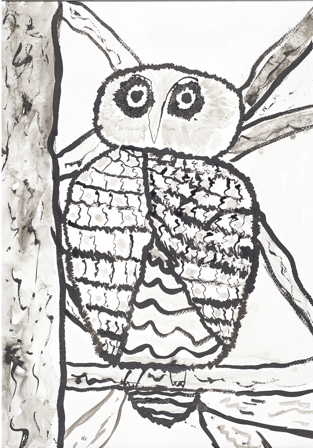
Powerful owl by Anneliese Gutwenger (age 10)