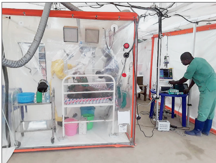
Health Workers in Beni, Democratic Republic of Congo, using the CUBE System to Monitor and Treat a Patient with EVD.

The 2013–2016 West African EVD epidemic was declared a global public health emergency and led to global recognition that emerging infectious diseases once considered “tropical” in nature must now be considered global threats that can emerge in a remote location one week and appear as new clusters of infections in even the most distant settings the next. Distance is no longer a reliable barrier to the spread of such diseases, but it has continued to determine the level of care a patient is able to receive. Within the broader context of the WHO’s universal health coverage and Sustainable Development Goal initiatives, and as the treatment paradigm for patients with EVD shifts from isolation to aggressive supportive care and antiviral therapy,