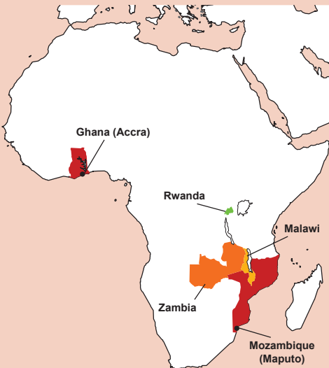
Map showing location of FCFA case studies

The Malawi case study focused on three thematic areas of importance: food security, disaster risk management and social protection. Interviews with government and non-governmental stakeholders explored the current nature of decision-making processes and policy-making across sectors, including assessment of the use of climate information for long-term planning. A multi-stakeholder workshop drew on role play and simulations of development situations. This was to help participants to identify the needs of farmers, planners, community workers and other information users, as well as new opportunities to work with them. A 'serious game' examined the role of uncertainty in climate predictions, with groups 'paying' for information with varying degrees of certainty within a disaster management scenario. The activities encouraged participants to discuss how they make decisions in their current role and asked what climate information would be most useful and relevant to them.