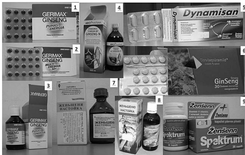
Figure 1. Pictorial representations of the P. ginseng preparations which were available and were shown to the respondents during the interview: 1. Gerimax tablets of ginseng extract; 2. Gerimax tablets of ginseng extract with vitamins and minerals; 3. Gerimax liquid extract of ginseng; 4. Ginseng N liquid extract of ginseng; 5. Dynamisan tablets of ginseng extract; 6. Strong GinSeng tablets of ginseng extract; 7. Zhenchenya nastoika tincture of ginseng; 8. Vishpha tincture of ginseng; 9. Spectrum capsules of ginseng with vitamins, minerals, rutin and lecithin

To assist the identification of the preparations nine different photos of preparations of P. ginseng available at the period of study were demonstrated to the respondents (Fig. 1). The pictures worked as triggers for activating mental herbal of the respondents (term proposed by Kołodziejska-Degórska) (29). Based on the experience of this study, several respondents recalled their use of P. ginseng only after seeing the pictures of the preparations. P. ginseng analogues were not illustrated with actual preparations.