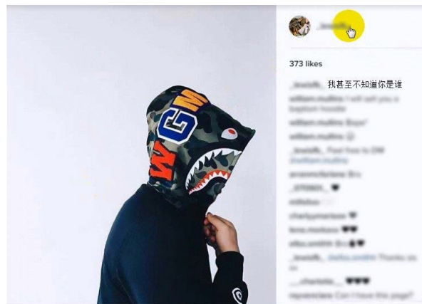
Figure 1: orchestrated post with image and aesthetic text

Moreover, our findings showed that the text modality was subjugated to a supporting role of the visual. Within the SNS posts that we observed and collected, text was sometimes present. However, it was included in the form of very short comments accompanying the visual content, either as a quote, or performing a decorative function. For example, P:2 told us that he “randomly” used text to complement his Instagram videos and he used emoji “just maybe to make it a bit nice...”. Employing a similar practice, the same participant shared a picture of himself on his SNS profile wearing an expensive “hoodie” orchestrated visually with a text caption in Chinese (see figure 1). After inviting him to reflect on this practice, the participant explained that he was not able to read Chinese and had used an online translator to translate an English sentence. Therefore, the meaning of the Chinese ideograms formed part of a cryptic message that was also aesthetically significant.