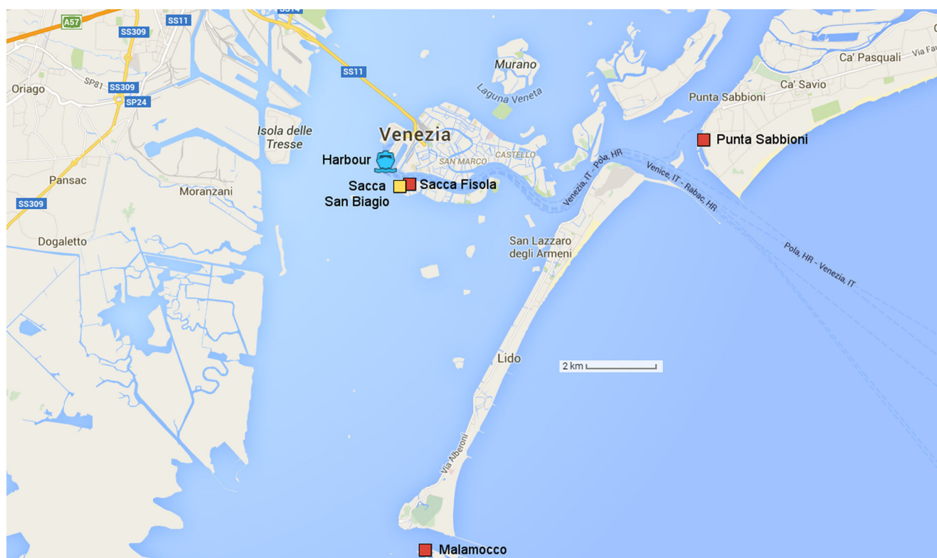
Fig. 1 Sampling site for PM 10 (red squares) and PAHs (yellow square)