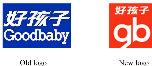
Figure 1. Comparison between Goodbaby’s previous logo and updated one

its logo (Figure 1) and creating a new brand framework 3 . The new design was developed by a Dutch studio, Beginstudio, which changed the logo by making it more modern and fresh: the name was shortened into the initial “gb” and its font was also change, but the Chinese characters remained unvaried, as the brand is nationally known with it. Logo texts are kept in white color, but the color’s background turned from blue to red color.