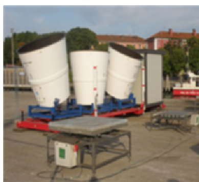
Figure 1. RASS/Sodar station with the Sonic Anemometer.

The mobile RASS- Airone provided by ISMES-CESI was installed on board a 13 m semi-trailer carrying a container containing acquisition electronics, Doppler radar and an acoustic generator. Remote measurement takes place when the acoustic generator emits a brief impulse upward and the corresponding radio echo captured by the Doppler radio receiver antenna is analyzed. The SODAR LP-120 was provided by ISMES-CESI and is composed by three individual antennas aimed in specific directions to steer the acoustic beam. The Sonic Anemometer METEK-USA 1, provided by ISMES-CESI uses ultrasonic sound waves to measure wind velocity. They measure wind speed based on the time of flight of sonic pulses between 3 pairs of transducers. The instrumentation is connected with a data capture system Meteoflux®, that allow to collect real time data of the three wind component and of the eddy covariance requested for the calculation of turbulence parameter and of radiation fluxes. The anemometer was coupled with a meteorological station to measure local temperature, pressure, humidity and precipitation. Several sensors have been located to collect radiation and heat flux data. The instrumentation is showed in Figure 1.