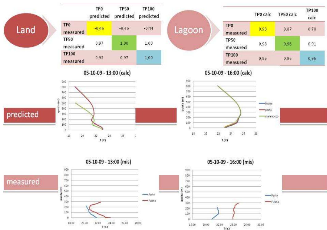
Figure 4. Comparison between predicted and measured data, land – lagoon case.

Data predicted were compared with measurements for the two periods. Generally the model tends to make homogeneous the data over the study area than reality and the vertical profiles are strongly influenced by upper air data used as input of the simulation. Differences appear more in the lower levels than over the 100 m height. An example for temperature data is showed in Figure 4). Despite this, comparison shows a good correlation between predicted and measured except for data near the surface. That is probably due to the fact that surface meteorological data used by the model are interpolated among a big number of local stations, while measured data refers to a unique value.