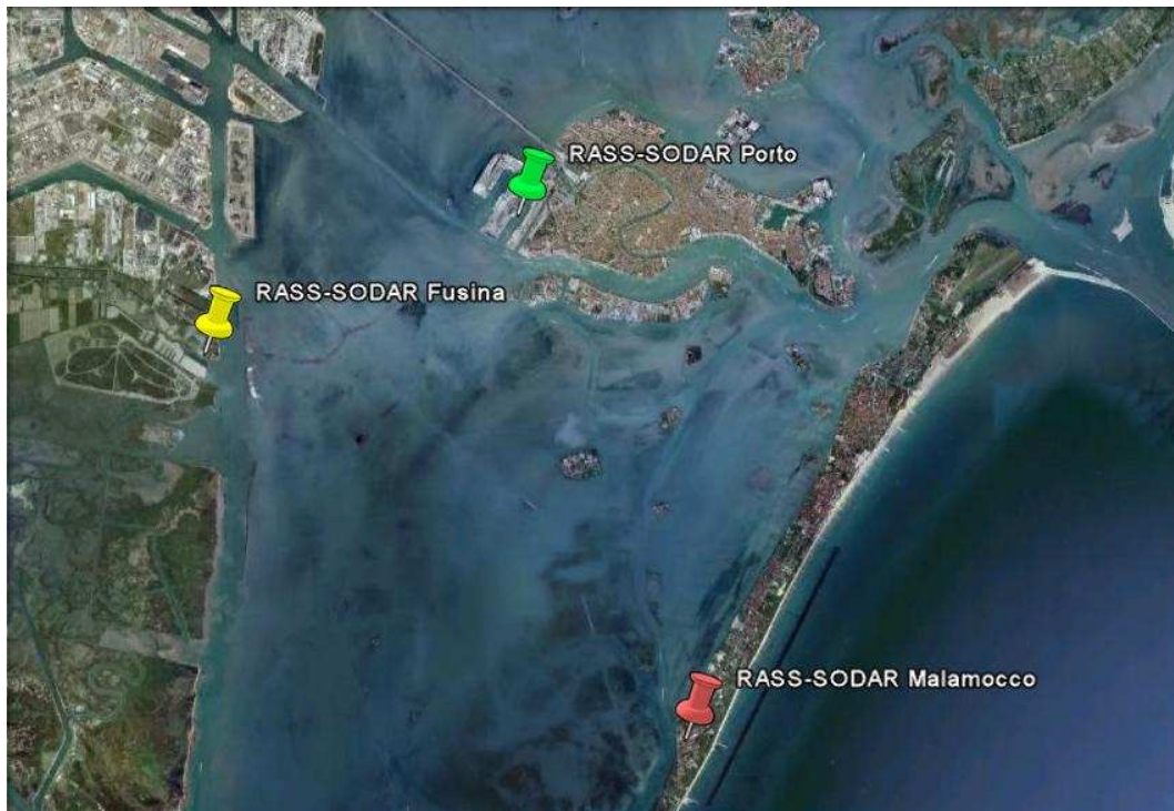
Figure 2. Sample sites location in Venice area.

Measurements have been used to validate a diagnostic meteorological model ( MINERVE ) (Desiato et al., 1998, Aria Technologies, 2001) and a turbulence model ( SURFPRO ) (D'Allura et al., 2004). Minerve is a 3D wind field model for complex terrains; it produces a mass-consistent wind field with data from a dispersed meteorological network. Temperature and humidity fields can also be interpolated. SURFPRO produces the fields of dry deposition velocities and turbulent diffusivities.