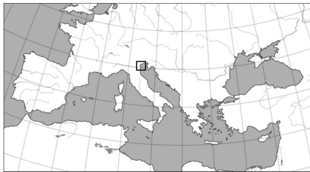
Figure 1. The study area in the Mediterranean context.

The analysis was carried out on 18 unpublished phytosociological relevés. Data were collected according to the cover-abundance scale of Braun-Blanquet (1964). The surveys were elaborated on the basis of hierarchical classification (Anderberg 1973; Westhoff & Van der Maarel 1978) using the package Syn-tax 2000 (Podani 2001) (Figure 2). In the phytosociological table (Table I), the relevés sequence corresponds to that of the dendrogram. The concepts of character, differential and transgressive species are in accordance with Mucina (1993). In the phytosociological table, symbols are as follows: d = differential species; part. char. = partial characteristic species; tg = transgressive characteristic species; C = Class; O = Order. Life forms are in