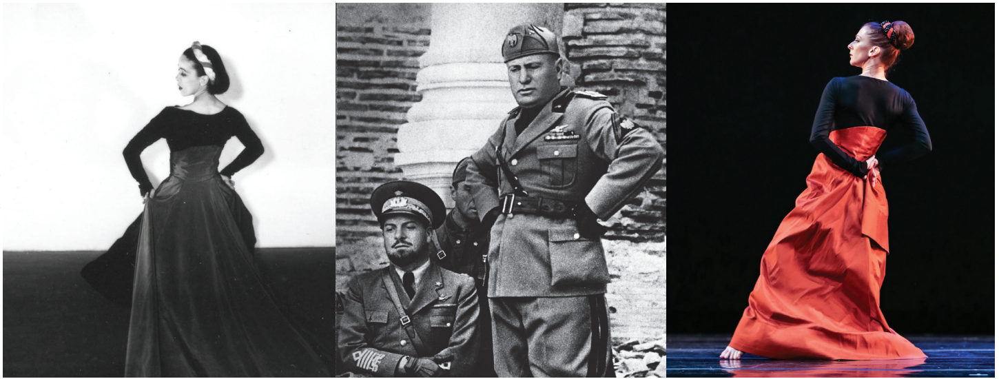
Fig 9, 10, 11 (left to right): Martha Graham; Benito Mussolini in Libya, 1937; Blakeley White-McGuire ( Imperial Gesture , 2013).

by using an image that history has ratified as a symbol for imperialism. The use of these images, among others, served to close the distance between the immediate political climate of Imperial Gesture 's 1935 moment and 2013, decisions informed by the power of iconicity in its several forms.