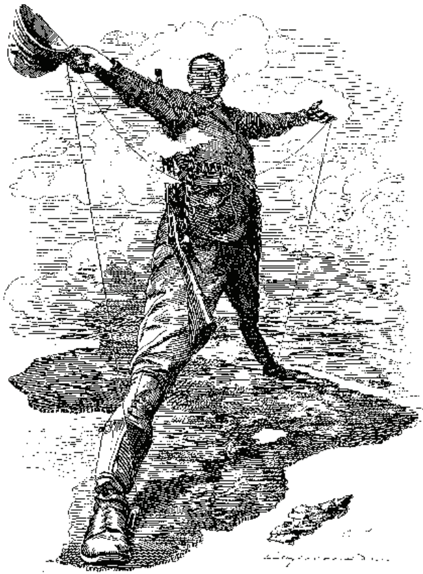
Fig 7: "The Rhodes Colossus" by Edward Linley Sambourne (1892).