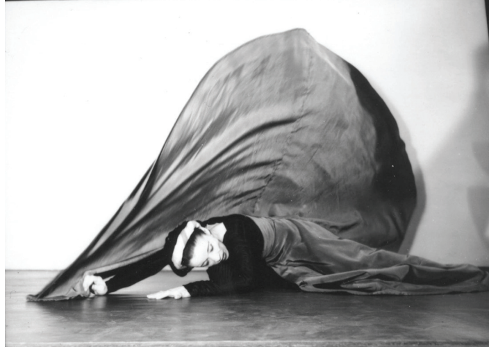
Figs. 2 - 4: Photos of Martha Graham