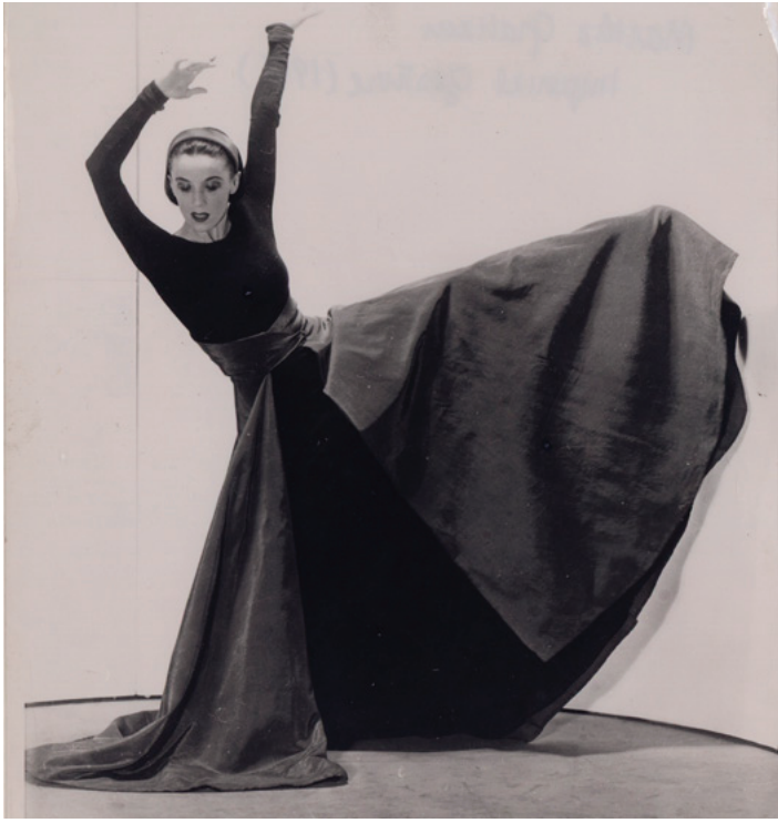
Fig. 5: Photo used for Apple's 1997 "Think Different" campaign. Martha Graham ( Frontier , 1935).

In Graham's cameo of archival footage, (falling between an Alfred Hitchcock interview clip, and Jim Henson talking exuberantly with Kermit the Frog) she performs one second of a solo from her 1935 dance, Frontier (Shields). Even if viewers are not familiar with Graham's oeuvre, many would recognize Frontier from the pinafore costume, Isamu Noguchi's modernist mise-en-scène of intersecting ropes, and of course Martha's signature headband (Morgan 18-29). Only the stretched purple fabric costume of Graham's Lamentation is more iconic an image of her early work (31-37). Taken together, these details signify "Martha Graham," and it is easy to assert that any recognizable image of Graham signifies "modern dance." That an artist's life's work can be conjured through one second of archival footage points not only to the power of the artist but to the power of iconicity.