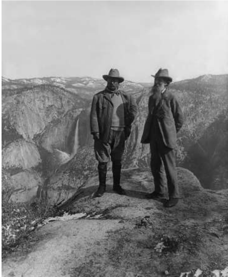
Roosevelt and John Muir

In 1871, the family made its second, long trip abroad. The trip's demanding itinerary indicates his parents' active encouragement of a vigorous outdoor life, and an education that married