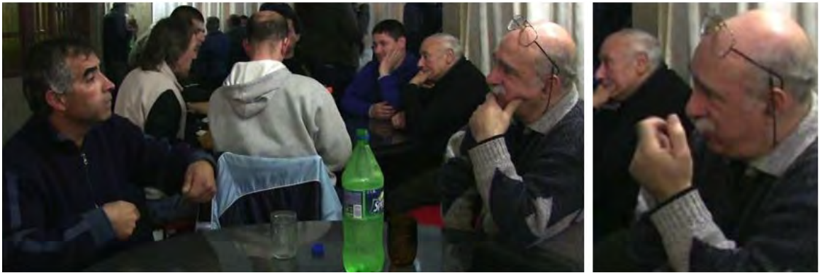
Figure 2: Stills of line 1 (L) and line 2 (R). In line 2, B initiates repair by offering a candidate understanding: ‘{of} cars?’. His raised eyebrows indicate a polar question.

Finally, there is the alternative question format type, in which the person initiating repair offers multiple candidate solutions to be accepted or rejected (Koshik 2005). This is an infrequent type, as with alternative questions generally, that appears to be a grammatical possibility in all of the languages. It is akin to the restricted offer type in offering a possible solution, rather than requesting one. Here is an example from Italian (Rossi, this issue). Speaker A mentions “ten pictures”, upon which speaker B asks: “his or someone else’s?”, presenting the prior speaker with two possible understandings. In response, Speaker A disconfirms the first of these options and affirms the second by repetition.