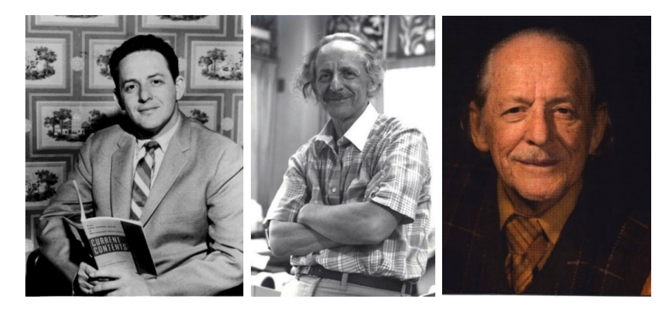
Figure 4. Pictures of Eugene Garfield that accompanied his essays in Current Contents .