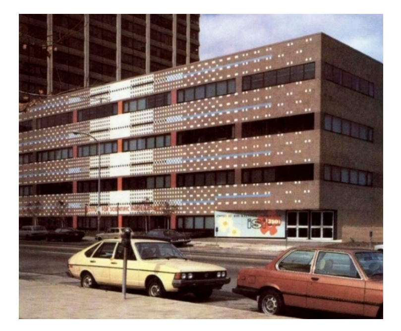
Figure 1. Institute for Scientific Information (ISI) at 3501 Market Street, Philadelphia.

In 1960, Garfield founded the Institute for Scientific Information (ISI) in Philadelphia (Figure 1), which became a powerful engine for developing innovative information products [14,15].