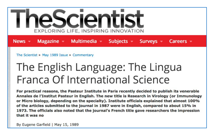
Figure 6. An article by Eugene Garfield promoting English as the international language of science published in The Scientist magazine.